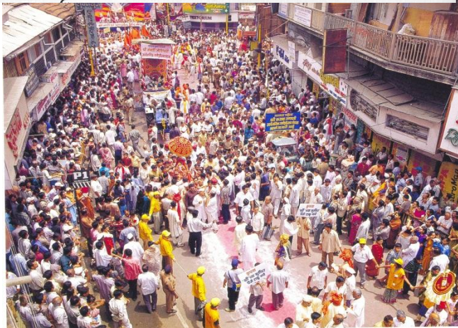
Figure 3: Mixed Community Structure [4] and Streetscape during Ganesh Festival [5]

e) Activity Pattern/ Land Use: There are multiple usages of urban space with mixed land uses properly integrated and confirming with each other. The residence and work place of the people are close by and often coincide with each other. At certain places there is concentration or specialization of certain activity within the streets, for example: Sonya Maruti Chowk specializes in gold jewellery work, Laxmi Road in textiles and clothing etc. The interconnecting network of primary, secondary and tertiary streets fosters close community living. Apart from being major arteries of commutation, primary streets reflect variety of everyday human activities of work, recreation, commerce and informal