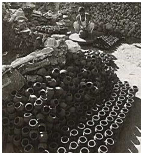
Figure 3: Kumbharwada: Node of specialized activity [4]

f) Townscape qualities: The inner core of the city has distinctive townscape qualities. The legibility of the area is strengthened by visual cues such as major landmarks like Mandai, Shaniwarwada etc., gateways, olfactory and character areas. There are nodes of public spaces such as water tanks (hauzs), tree canopies (paars), market areas (bazzars) along vibrant city networks. The urban forms in city network are traditional and distinctive in nature but under constant pressures of encroachment.