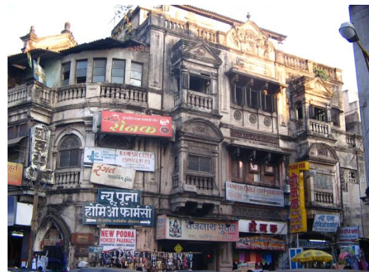
Figure 2: Streetscape of old Pune city during 17 th century [4] and 19 th century respectively [5]