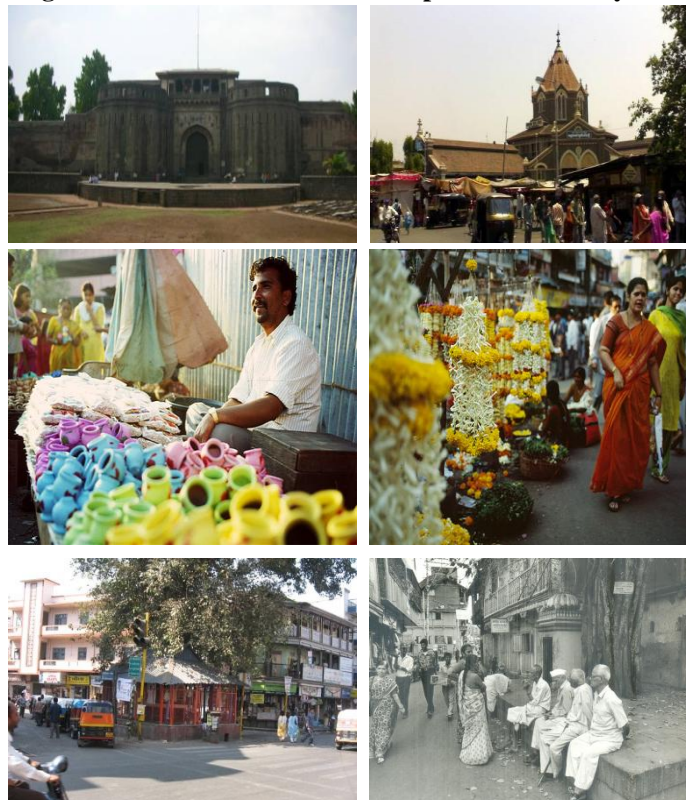
Figure 4: Major landmarks and nodes of public spaces: Shaniwarwada, Mandai-market place, tree-pars [5][4]