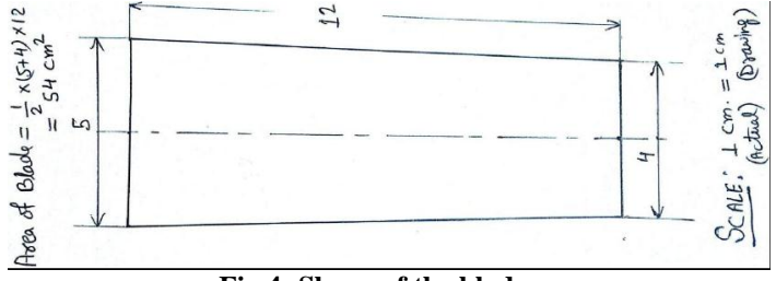
Fig 4: Shape of the blade

F<sub>D</sub>=12×1000×0.2250×0.277 ; F <sub>D</sub>=8.6805 N (Relative)