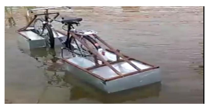
Fig 5 : Floating bicycle during floatation test

Before going for the final testing inside the running water, we have to check it once that bicycle should float on the water. During this floatation test, bicycle should also remain stable so that it could balance the weight of the whole body (proposed model). To conduct this test we immersed the bicycle in the water and leave that. After some time it was stable and float on the water as shown in the figure 5