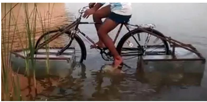
Fig 7: Driving test inside the water

Hence at the end we can say that proposed model can easily move on the land as well as on the water also. In this way