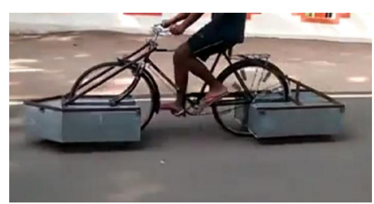
Fig 6: Driving test on the road

It was the major part of the testing on the model to conduct the driving test on the model fabricated. This test was conducted into two steps as initially it was tested on the land followed by testing it in the water. As shown in the figures 6 and 7, it was smoothly running over the land and water.