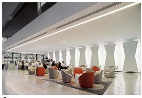
Q31 (Melbourne, Australia)