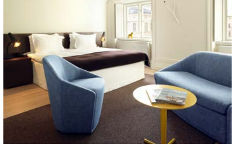
Skeppsholmen Hotel (Stockholm, Sweden)