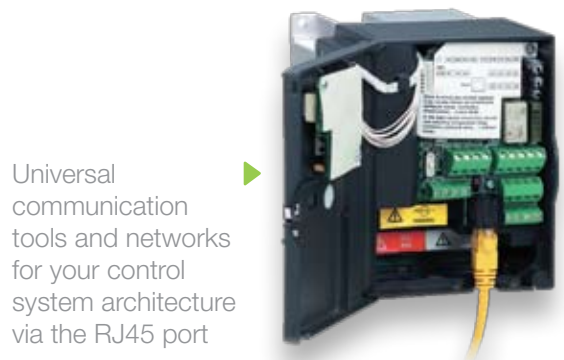
▶ Universal communication tools and networks for your control system architecture via the RJ45 port