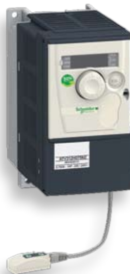
◀ Simple-loader allows you to quickly load the same configurations on several machines

Duplicate the configuration using Schneider Electric's simple loader and multi-loader, or the Altivar 312's bluetooth interface. The multi-loader stores configurations of several drives on a standard SD memory card and allows you to simply load it directly into your PC or drive. The simple loader maintains the settings of single drive for transfer.