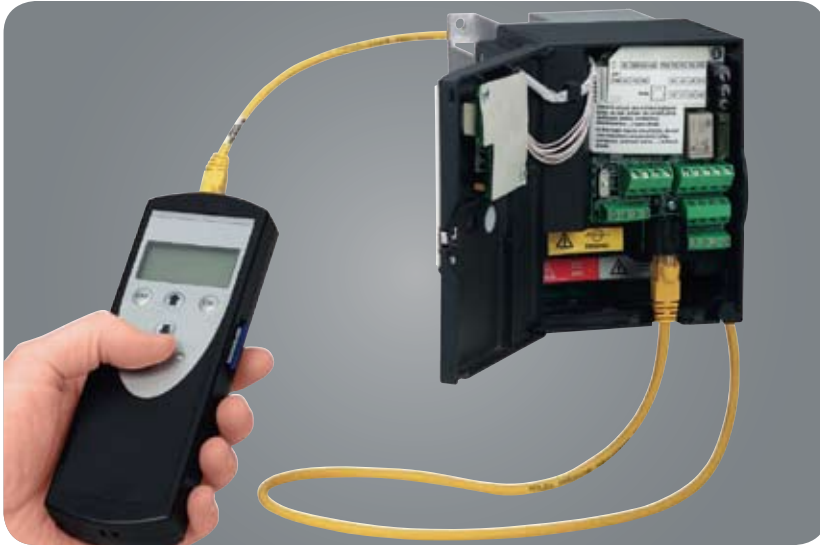
▲ Multiloader stores configurations for multiple drives