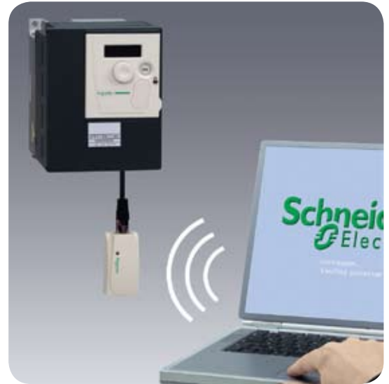
▲ Bluetooth compatible

The Altivar 312 drive integrates seamlessly into your architectures and communicates with all control system products to optimize machine performance. It offers numerous communications options, including Modbus and CANopen as well as option cards for CANopen Daisy Chain, DeviceNet and Profibus DP.