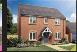
THE LINWOOD Three bedroom house