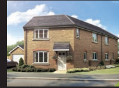
THE NEWTON Three bedroom house