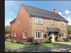
THE RAITHBY Four bedroom house