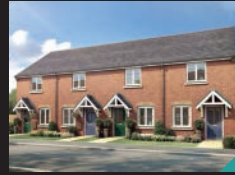
THE HEMINGBY Two bedroom house