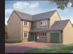
THE TATTERSHALL Four bedroom house