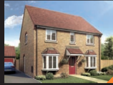
THE REDBOURNE Four bedroom house