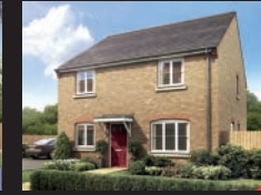
THE RIPPINGALE Five bedroom house