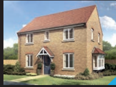
THE NORMANBY Three bedroom house