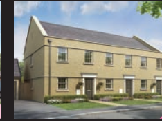
THE BENINGTON Three bedroom house