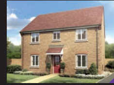
THE ANCASTER Four bedroom house