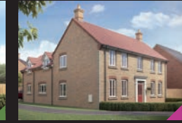
THE WALTHAM Five bedroom house

DESIGNED WITH PASSION. BUILT WITH PRIDE.