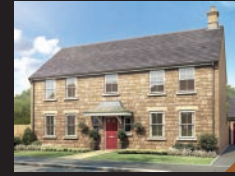
THE EDENHAM Four bedroom house