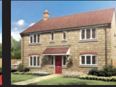
THE MIDDLETHORPE Five bedroom house