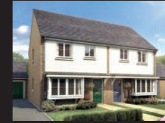
THE WINTHORPE Three bedroom house