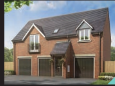
THE UPTON Two bedroom coach house