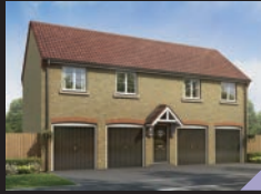
THE ROXBY Two bedroom coach house

Please see separate information sheets for more details.