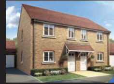
THE NETTLEHAM (v2) Three bedroom house