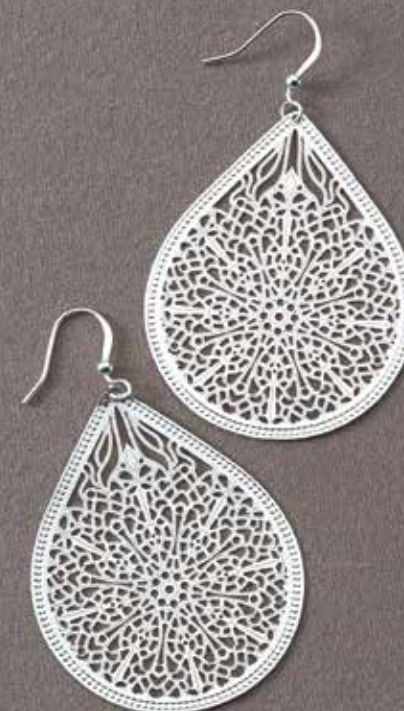
F9864 MARVELOUS MANDALA EARRINGS Pendientes mandala maravillosa A delicate stippling effect is found throughout the ornate filigree of these surprisingly lightweight earrings. French wires. 2" L. $14.00