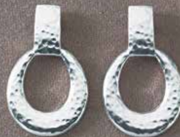
F9831 DOORKNOCKER EARRINGS Pendientes aldabas Hammered silver statement earrings retain their shine, making them a must-have for any jewelry collection. Post backs. 1-1/2" L. $11.00