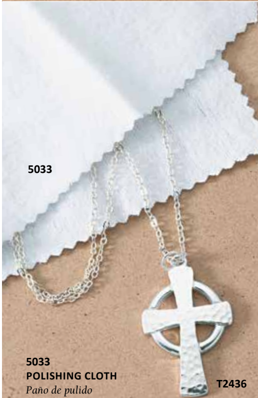
5033 POLISHING CLOTH Paño de pulido 6" L x 6" W polishing cloth is 100% double napped cotton flannel, treated with our non-scratch, micro-abrasive polishing compound to keep your jewelry bright & shining for every occasion. (Jewelry not included.) $6.00 T2436