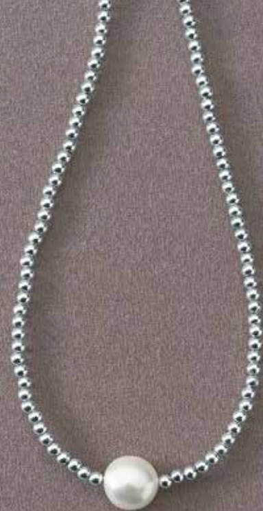
F9757 BEADED PEARL NECKLACE Collar de perla y cuentas plateadas Achieve a timeless and classic look with this piece of jewelry. Silver seed beads throughout with a single pearly bead as the focal point. 18" L. $28.00