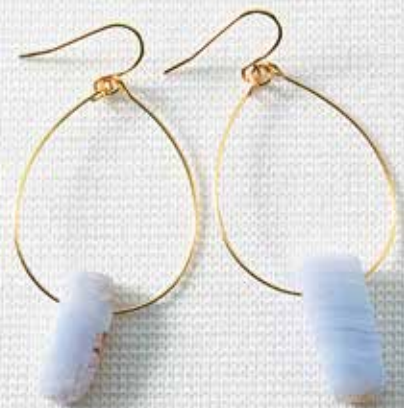
F9344 ABSTRACT OBELISK EARRINGS Pendientes de obelisco Thin gold wires threaded through lavender dangles give these earrings an effortless, yet chic look. French wires. 2-3/8" L drop. $20.00