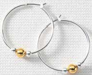
F9369 A DROP OF GOLD HOOPS Pendientes de aro "Gota dorada" Sturdy hoops gain personality and a touch of elegance with a triple-bead design. Saddleback closures. 1-1/2" Dia. $16.00