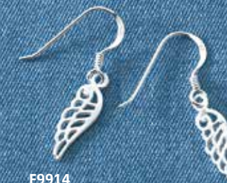
F9914 WHERE ANGELS FLY EARRINGS Pendientes "Donde los angeles vuelan" Petite silver cutout earrings lend a miraculously stylish edge. French wires. 3/4" L drop. $10.00