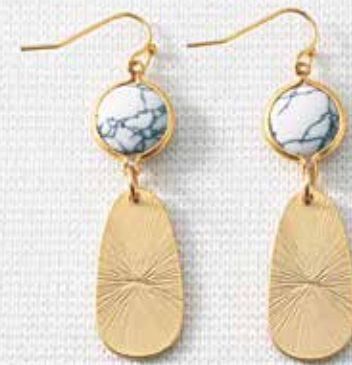
F9435 TEXTURED OBLONG DANGLES Pendientes colgantes largos y texturizados Oblong drops with textured detail dangle from gold-wrapped marbled accents. French wires. 2" drop. $12.50