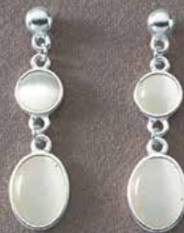
F9823 OVER THE MOON DANGLE EARRINGS Pendientes colgantes "Sobre la luna" Add instant elegance to your look with these polished earrings showcasing milky white stones. Post backs. 1-1/2" L drop. $12.00