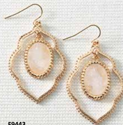
F9443 WINDOW DRESSING DANGLES Pendientes colgantes de cristal Crystal clusters gaze through uniquely shaped gold-toned windows for an eclectic look. French wires. 1-7/8" drop. $12.00