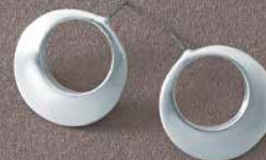
F9856 MATTE SILVER HOOP EARRINGS Pendientes de oro mate de plata You'll love wearing these bold-profile earrings all the time, day or night. Post backs. 1" L drop. $11.00