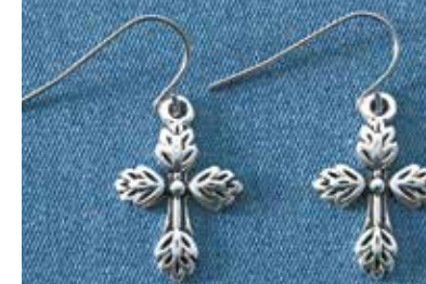
F9880 ELEGANT CROSS DANGLE EARRINGS Pendientes elegantes de cruz These beautifully detailed crosses of bright silver have subtle antiqued elements. Shepherd's hook backs. 1" L drop. $10.00