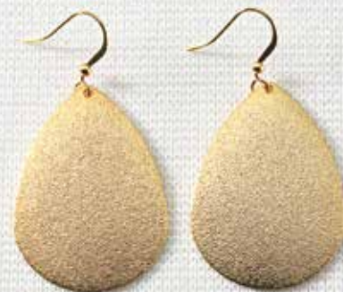
F9419 GLITTER AND GOLD EARRINGS Pendientes dorados brillantes Fashions may come and go, but these lightweight gold-tone teardrop dangles will forever be a staple in your collection. French wires. 1-5/8" L drop. $12.00