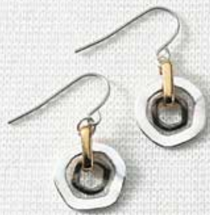
F9351 CENTERED CIRCLES EARRINGS Pendientes de círculos centrados The multi-tones of hammered silver circles gathered in a smooth golden clasp means these earrings pair beautifully with any outfit. Shepherd hook backs. 7/8" L drop. $15.00

All jewelry is manufactured without lead and nickel.