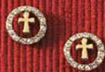
F9377 TREASURED FAITH POSTS Pendientes "Fe valorada" Simple gold crosses surrounded by a ring of crystals make an excellent addition to your jewelry box. Post backs. 1/2" Dia. $10.00