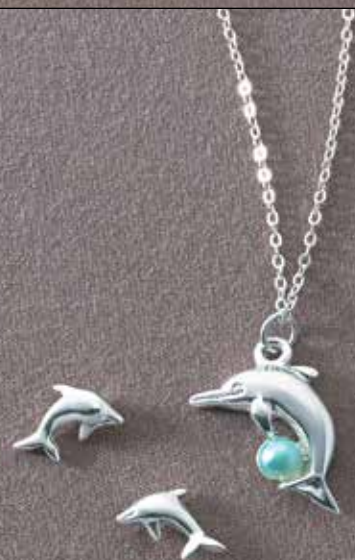
F9773 DOLPHIN EARRINGS Pendientes de delfin Dive into cute style with these silver dolphin stud earrings. Post backs. 1/2" L. $7.50