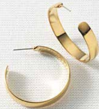
F9401 CLASSIC AND CHIC C- HOOP EARRINGS Pendientes de aro clásicos Make any outfit a statement by adding these gold hoop earrings. Post backs. 1-1/2" W. $14.00