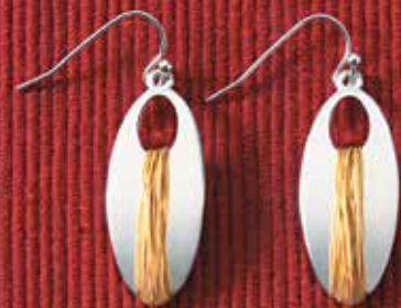
F9385 THAT'S A WRAP DANGLES Pendientes colgantes envueltos de alambre dorado Get wired to the latest style! These duo-tone earrings feature smooth silver ovals textured with gold-tone wrapping through the middle. French wires. 1-1/4" L drop. $16.00