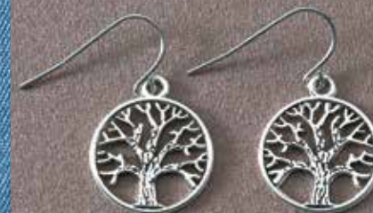
F9872 TREE OF LIFE EARRINGS Pendientes "Arbol de vida" Silver cutout design represents the connection of all forms of life to each other. Shepherd's hook backs. 1" L drop. $10.00