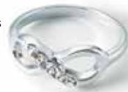
F9815 INFINITY RING WITH CLEAR CRYSTALS Anillo de simbolo del infinito Love is limitless! Features a sideways crystal-accented infinity symbol. $12.00