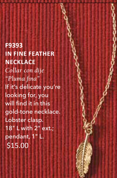
F9393 IN FINE FEATHER NECKLACE Collar con dije "Pluma fina" If it's delicate you're looking for, you will find it in this gold-tone necklace. Lobster clasp. 18" L with 2" ext.; pendant, 1" L. $15.00