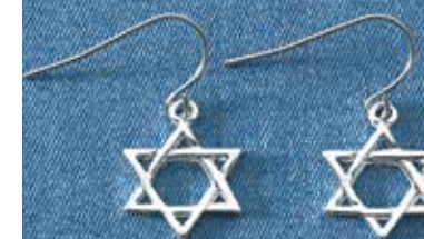
F9906 STAR OF DAVID EARRINGS Pendientes Estrella de David These symmetrical symbols are perfect geometry in polished silver. Shepherd's hook backs. 3/4" L drop. $8.00