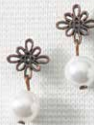
F9450 PETALS AND PEARLS DANGLES Pendientes colgantes de perla en pétalo Oversized pearl beads and bronzed blooms blend classic elegance and simplistic charm. Post backs. 1" L drop. $10.00