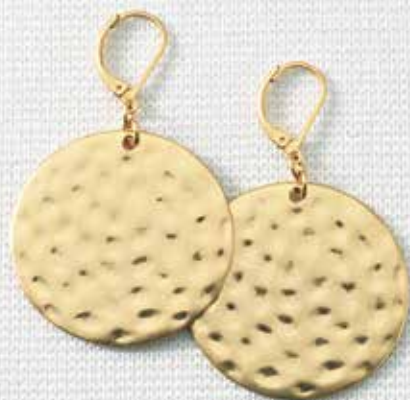
F9427 DIMPLED DISKS DANGLES Pendientes colgantes de discos Who knew dimples could be so dramatic? Gold-tone oversized disks are both light-catching and eye-catching. Hinged backs. 1-1/2" Dia. $15.00