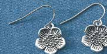
F9898 BONA FIDE BLOOMS EARRINGS Pendientes "Flores de verdad" Who doesn't love flowers, especially when they are as realistic as these! Shepherd's hook backs. 3/4" L drop. $10.00