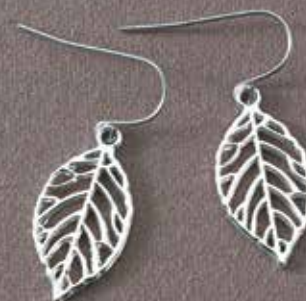
F9849 LEAF DANGLE EARRINGS Pendientes colgantes de hoja Stay in touch with nature all year long. The filigree cutout motif not only make them striking, but lightweight as well. Shepherd's hook backs. 1" L drop. $10.00