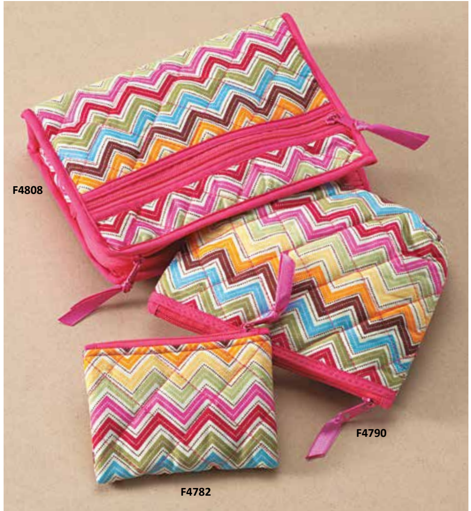
F4808 SHERBET RIC-RAC TOILETRY BAG Bolsa de aseo "Sorbete Ric-Rac" Structured bag with flat bottom and wipe-clean interior is perfect for toiletries when traveling. Zippered top, exterior zippered pocket and interior slip pocket. 9" W x 6-1/2" H. $12.00