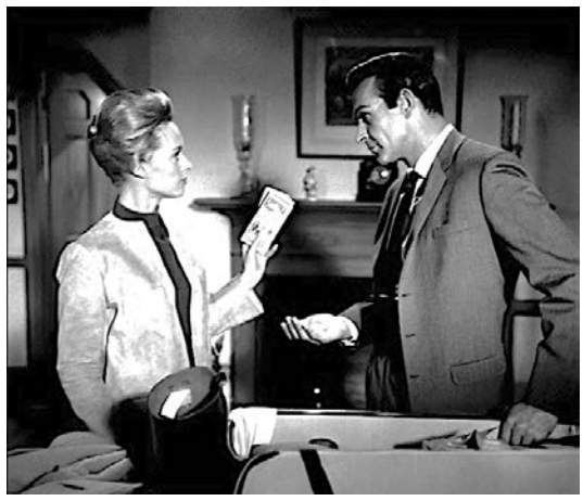
still image from Marnie (dir. Alfred Hitchcock, 1964)

nightmares, and sexual frigidity, which, unlike Marnie herself, never seem to lie.