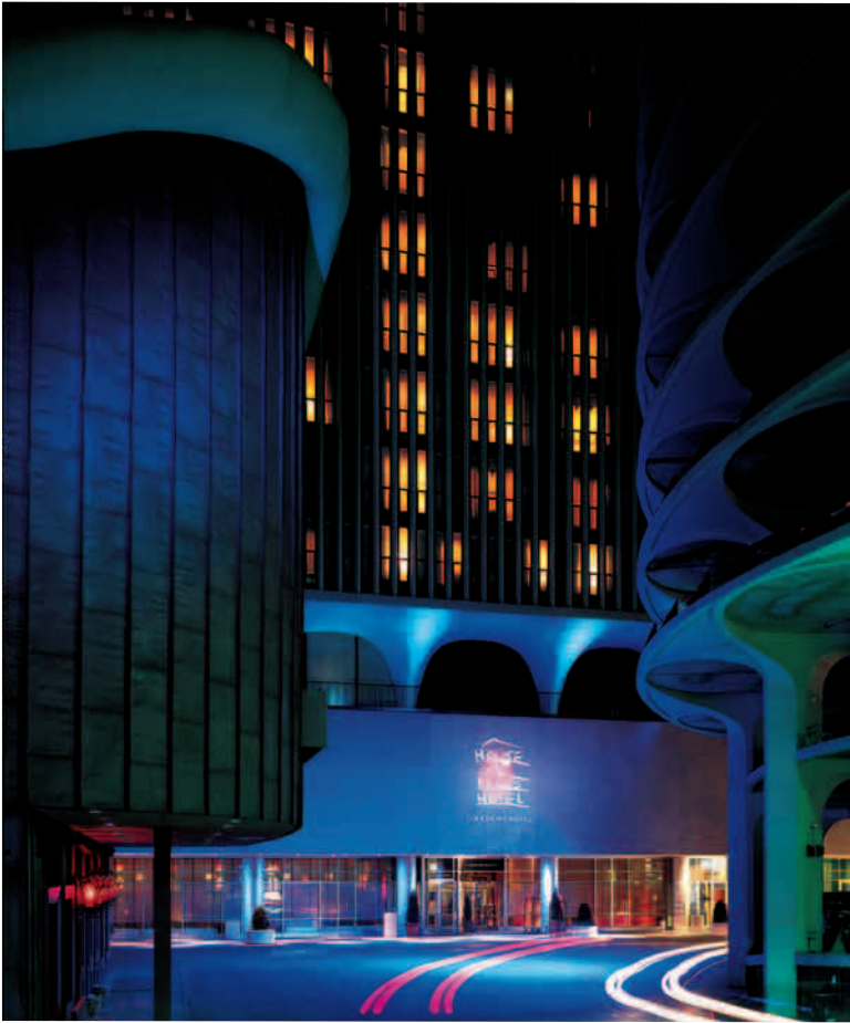
The House of Blues, A Loews Hotel