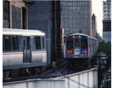
Chicago's elevated train, known as the "L," loops around the city and includes many stops in the downtown area.