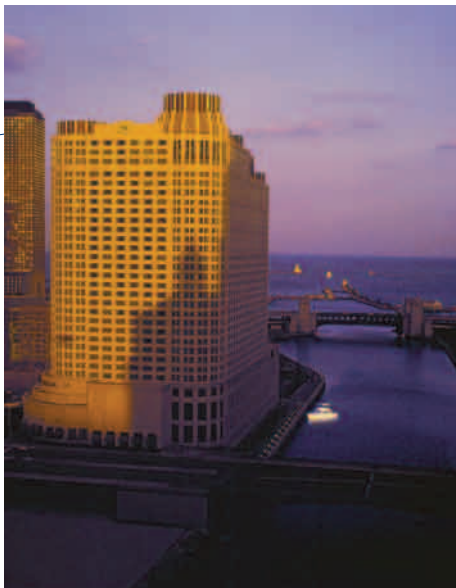
The Sheraton Chicago Hotel & Towers