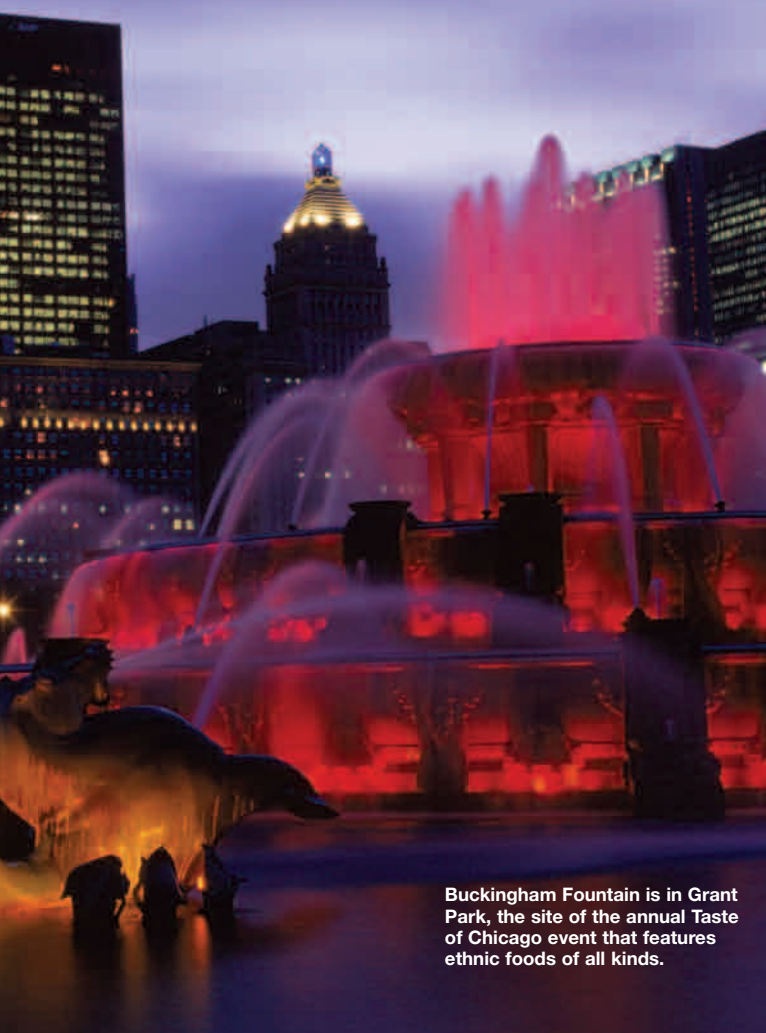
Buckingham Fountain is in Grant Park, the site of the annual Taste of Chicago event that features ethnic foods of all kinds.