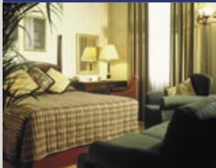
Millennium Bailey's Hotel, London