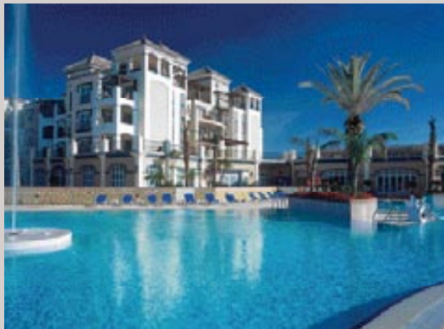
Marriott's Playa Andaluza