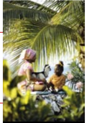
Montego Bay, Jamaica

Become an Admirals Club Member Off-Peak MileSAAver Awards Buy, Give, or Share Miles Receive Your Account Information via E-mail American Airlines European Websites U.S. Customs Update See More of the World on American Airlines Update: Upgrade Awards