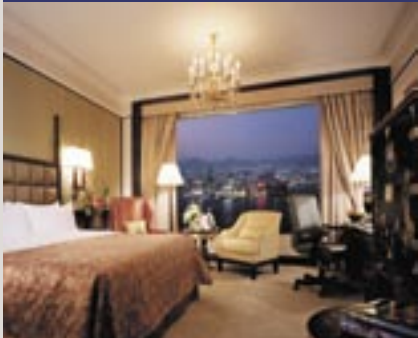
Island Shangri-La, Hong Kong

Experience the best of Shangri-La's legendary hospitality for less this winter. Earn double (1,000) AAdvantage miles at all Shangri-La Hotels & Resorts, including Traders Hotels, when staying on corporate rates and above.