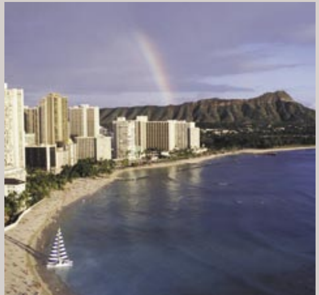
Waikiki Beach, Hawaii