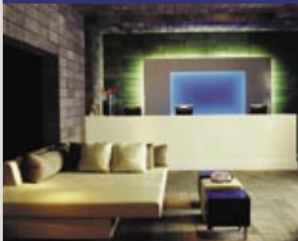
W Hotel, Mexico City

Receive double miles during your stay in 10 magnificent cities in Latin America plus access to the fitness center, pressing service for two clothing items, and late check-out. This offer is good at participating Sheraton® Hotels & Resorts, Four Points® by Sheraton, The Luxury Collection®, W Hotels®, and Westin® Hotels & Resorts.