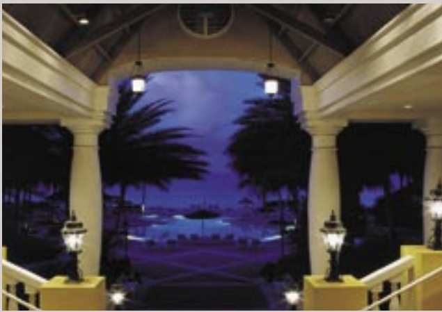
Curaçao Marriott Beach Resort & Emerald Casino