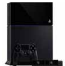
PS 4 Bundle 500 GB Console, (1) Controller