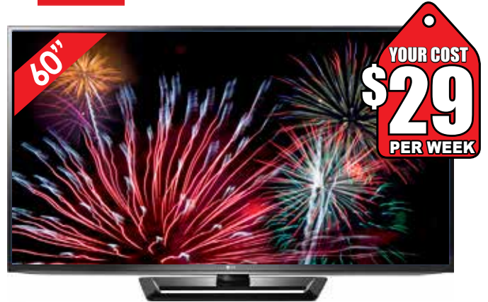
LG LED 60" TV $29.88 per week