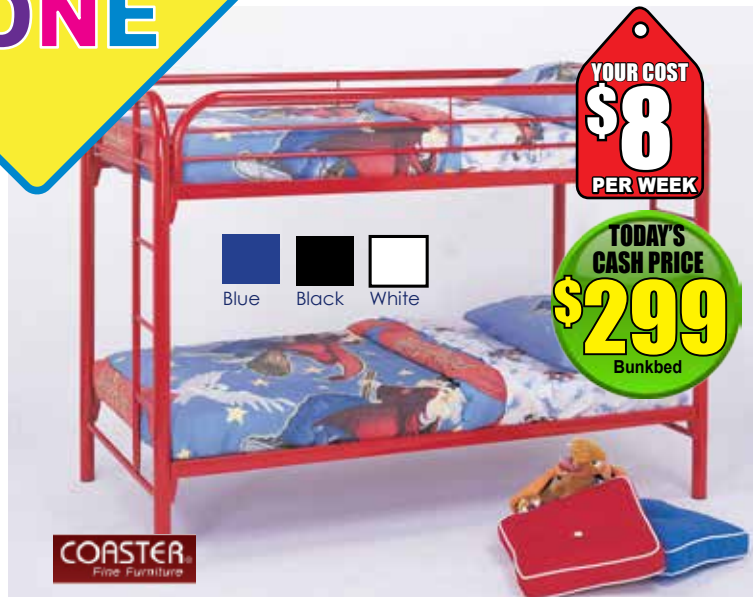
Twin/Twin Bunkbed $8.88 per week