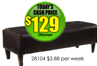
28104 $3.88 per week