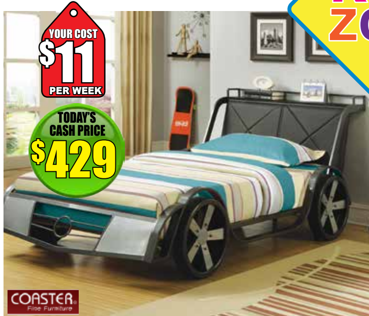
Twin Race Car Bed 400701 $11.88 per week