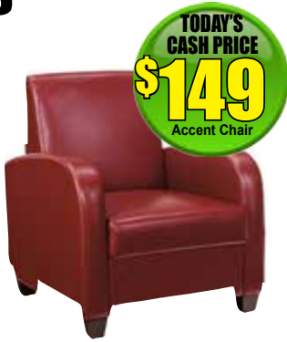
36603 $4.88 per week