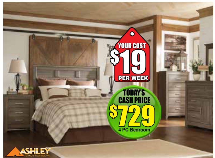
Juararo B251 4 PC Queen Bedroom $19.88 per week