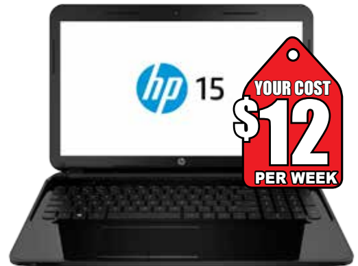
HP 15 Laptop 15.6" screen 4 GB Memory, 500 GB HD $12.88 per week