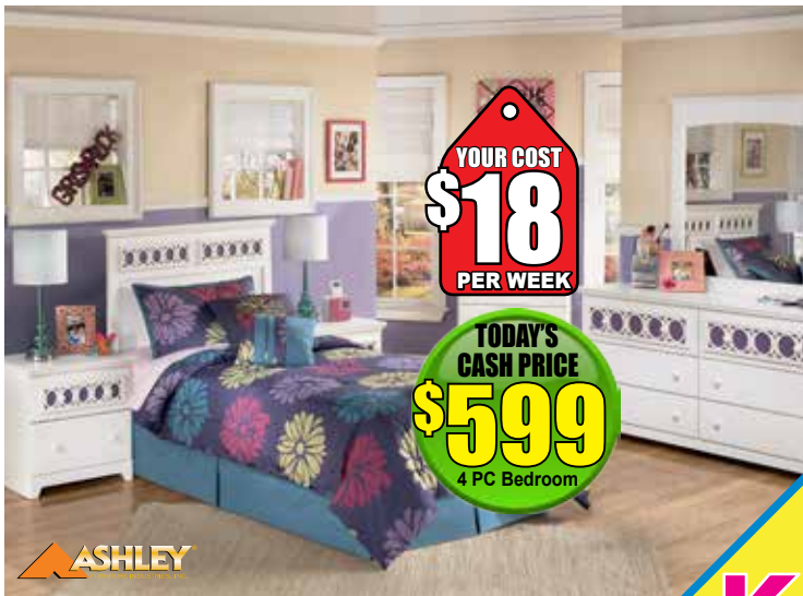
Zayley B131 4 PC Twin Bedroom $18.88 per week