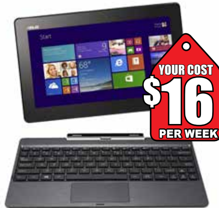
ASUS Transformer Book (Tablet + Keyboard Dock) 10.1" screen 64 GB Memory $16.88 per week