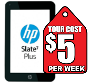
HP 7" Slate Plus Tablet 7" screen, 8 GB Memory $5.88 per week