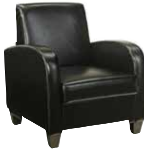
36604 $4.88 per week