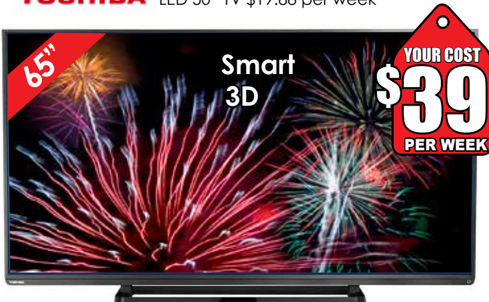
TOSHIBA LED 65" TV $39.88 per week