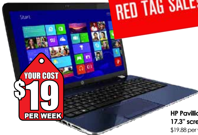
HP Pavilion Laptop 17.3" screen 8 GB Memory, 1 TB HD $19.88 per week