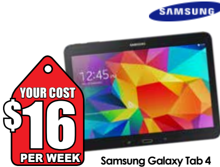
Samsung Galaxy Tab 4 10" screen 16 GB Memory $16.88 per week