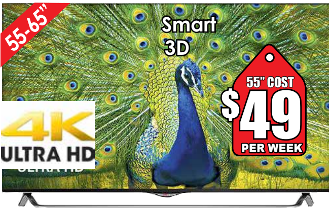
LG LED 55" 4K Ultra HD TV $49.88 per week LED 65" 4K Ultra HD TV $59.88 per week

Take your home theater into the future with this Ultra HD TV. 4K resolution displays movies, TV shows, video games and more with the utmost level of detail and clarity — 4x times the resolution of Full HD — and the Tru-Ultra HD engine converts SD and HD video to near-4K resolutions.