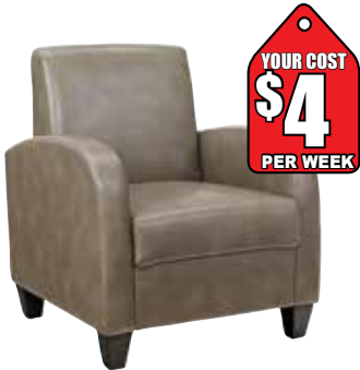
36602 $4.88 per week