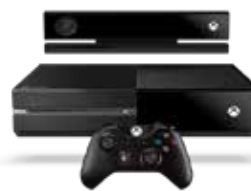
X-Box One Bundle 500 GB Console, Kinect, (1) Controller