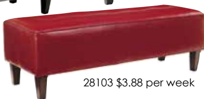
28103 $3.88 per week