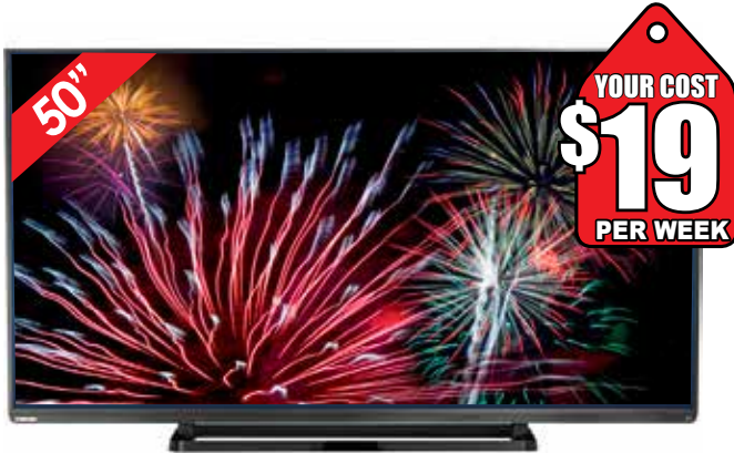
TOSHIBA LED 50" TV $19.88 per week