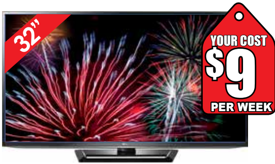
LG LED 32" TV $9.88 per week