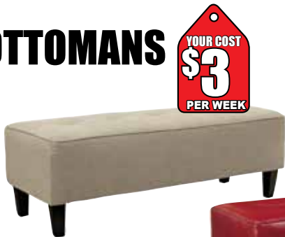
28101 $3.88 per week