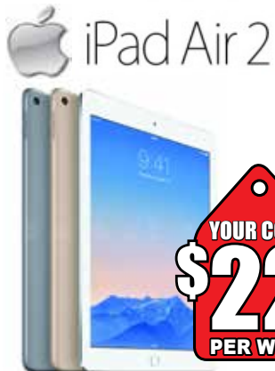
Apple iPad Air 2 10" screen 16 GB Memory $22.88 per week