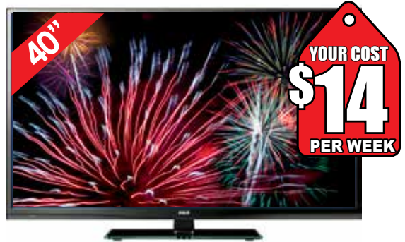
RCA LED 40" TV $14.88 per week