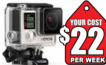
GoPro Hero 4 Features 1080p60 and 720p120 video, 12MP photo $22.88 per week