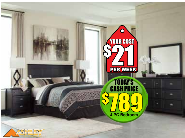
Prattfield B311 4 PC Queen Bedroom $21.88 per week