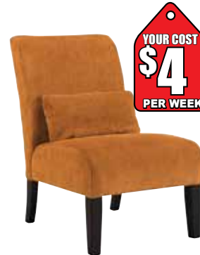
61602 $4.88 per week