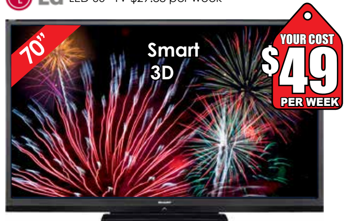
SHARP LED 70" TV $49.88 per week