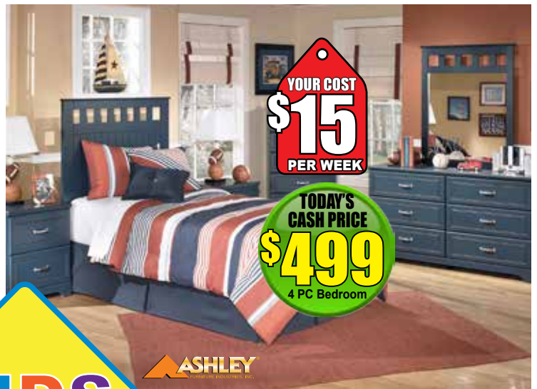
Leo B103 4 PC Twin Bedroom $15.88 per week