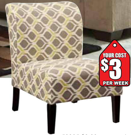
53305 $3.88 per week