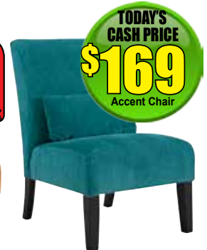
61604 $4.88 per week