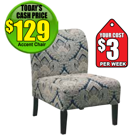
53303 $3.88 per week