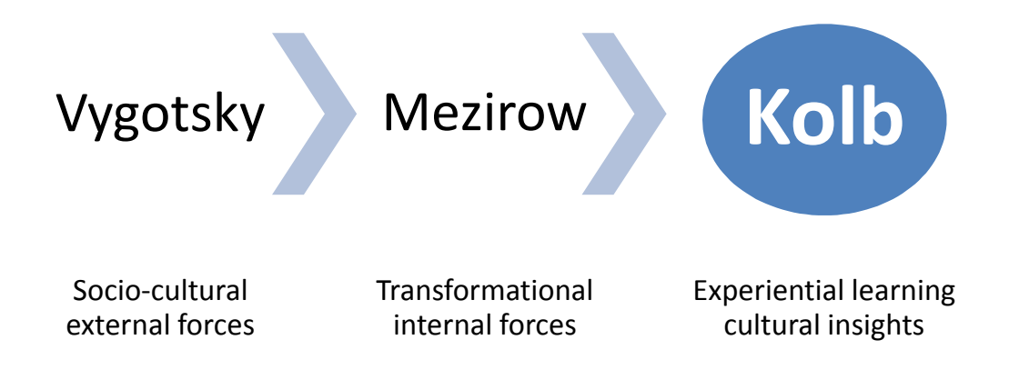
Figure 1: Theoretical Foundation for Study Design

Professional learning requires the complex task of transforming acquired knowledge into applied knowledge. To better understand how the participants in this study were making this transformation a theoretical model of learning was developed to better understand the cross-cultural experience. As shown in Figure 1, the model drew upon the experiential learning theory (ELT) (Kolb, 1984) and was supported by the foundational work of Mezirow (1981, 1991, 1994) and Vygotsky (1930-1934/1978).