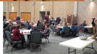
Boy Scout Sunday and Pancake Breakfast, February 17