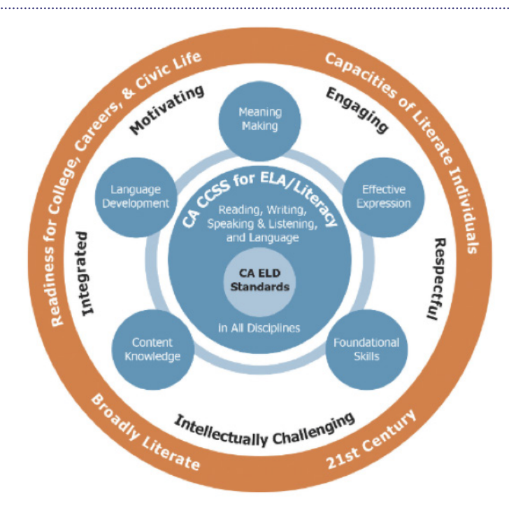
Figure 1. California English Language Arts/English Language Development Framework: Circles of Implementation

the core of teaching and learning for all grade levels: meaning making, effective expression, foundational skills, content knowledge, and language development. These themes act as organizing components for all grade-level teaching and learning, including TK-1, and throughout the ELA/ELD Framework there is a strong emphasis on the integration of these themes in learning tasks. All teaching and learning should be firmly grounded in the standards, and these five themes highlight the interconnections among and between two sets of standards: the CA CCSS for ELA/Literacy and the CA ELD Standards.