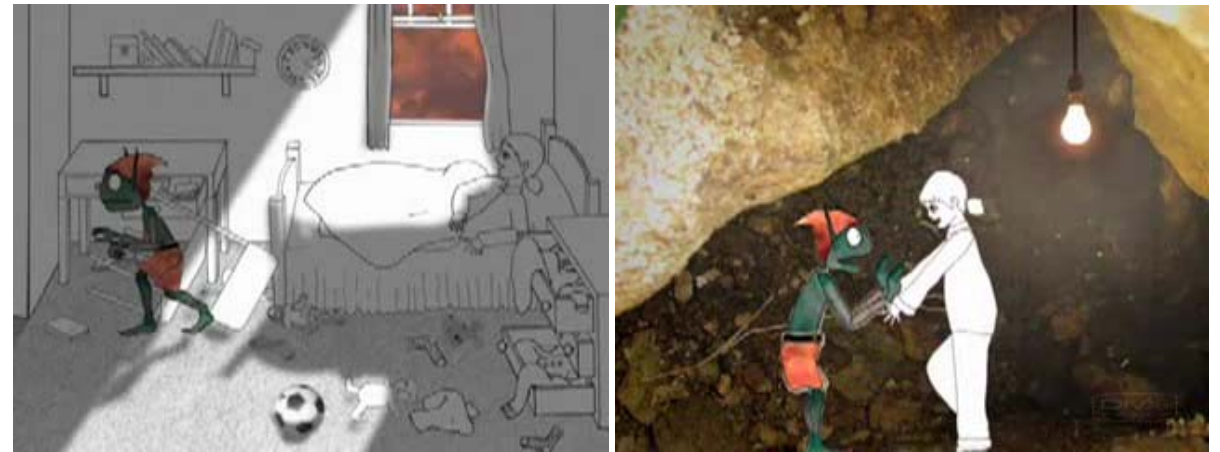
Figure 5. Two moments of the movie in which we can see the child-gnome interaction

The chosen film was from YouTube: http://www.youtube.com/watch?v=v6BRz-kJ2Zw&feature=dir