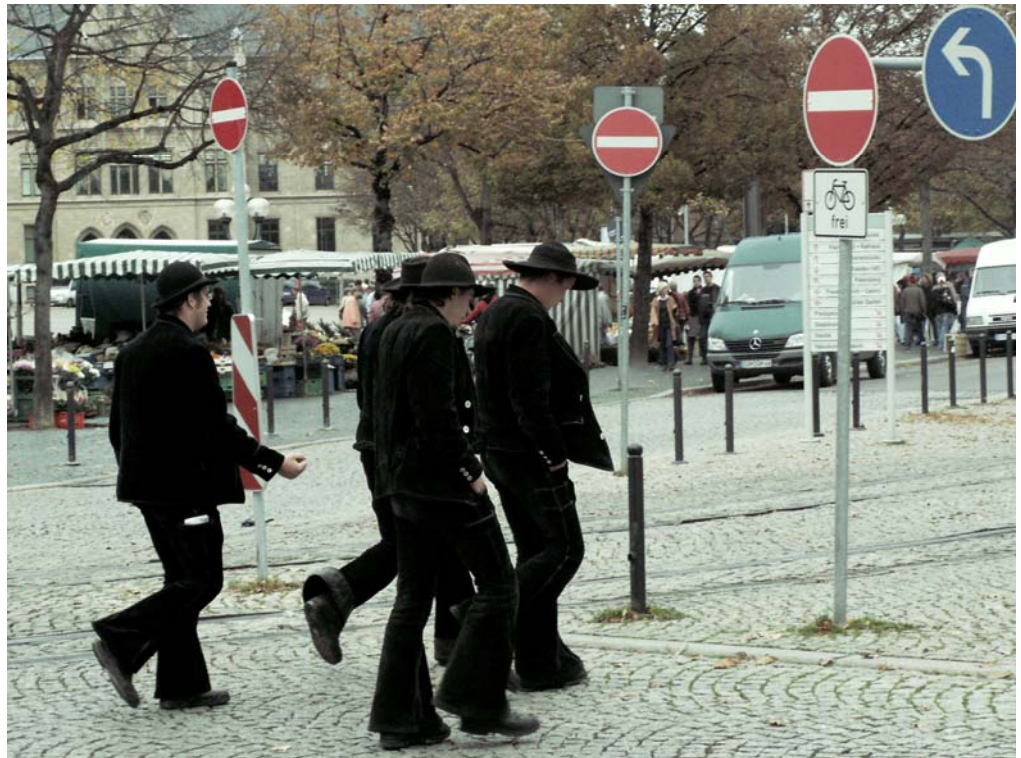
Figure 3. The photo used in Activity 2