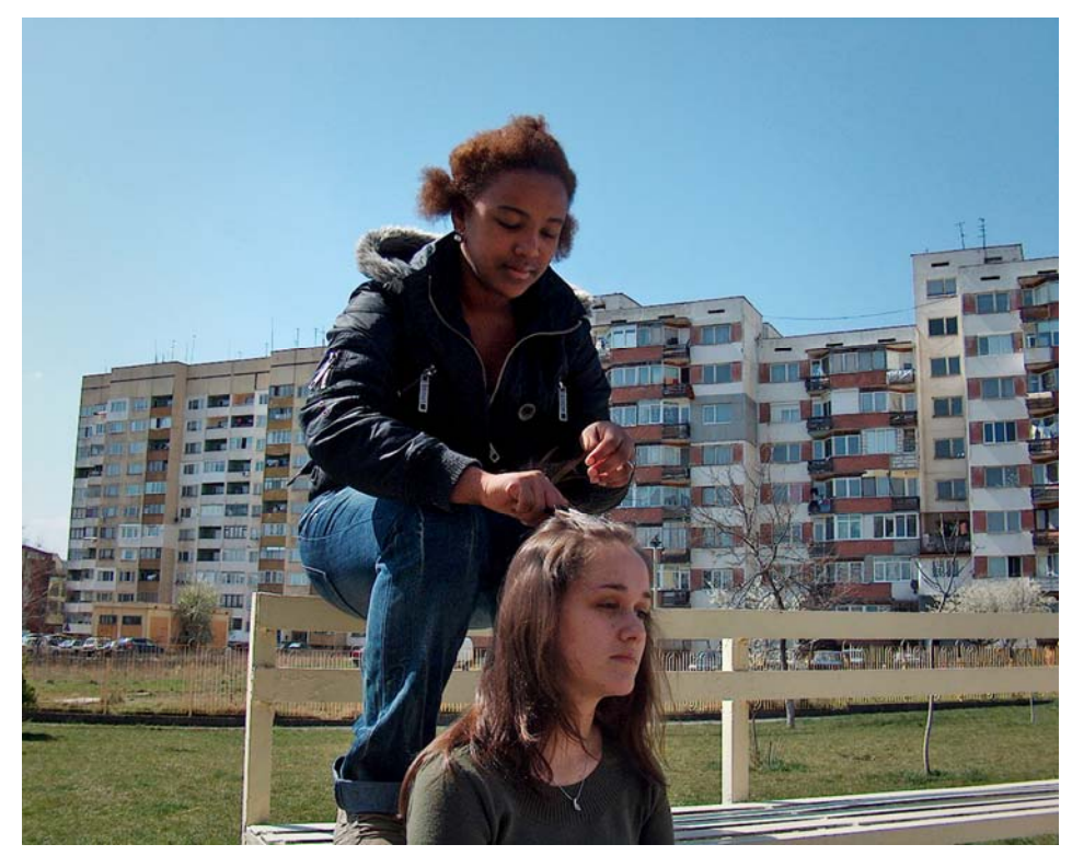
Figure 2. The photo used in Activity 1

1. Activity: Intercultural message of a photo. This activity was tried with school students, 5<sup>th</sup> class (age 10-11) in a school in Seixal, Portugal. In this activity the photo from Figure 2 was used. This photo was the winner of the photo contest with intercultural topic organized in the frame of the Comenius 2.1 project, ICTime. The photo was made by Miroslava Nikolaeva Valdashka from Bulgaria.