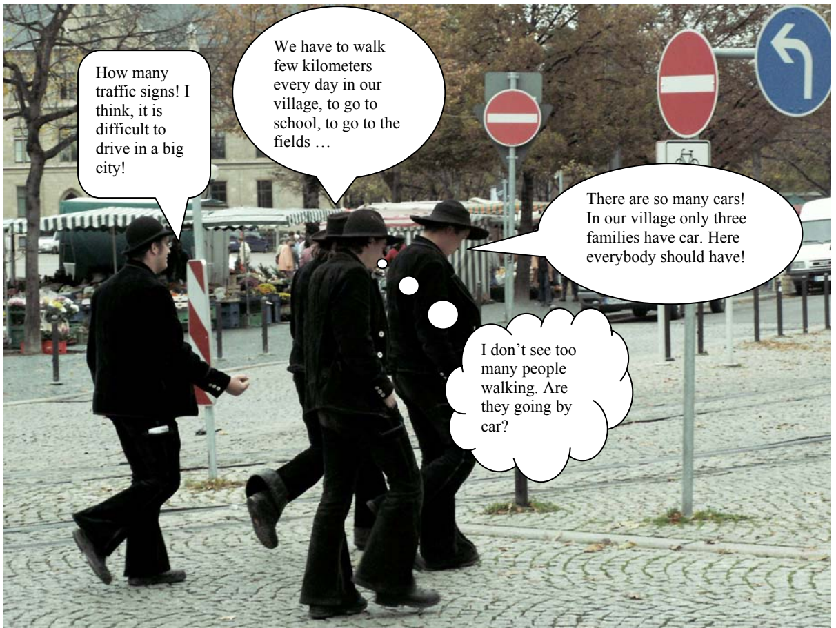
Figure 4. A dialog made in Activity 2

One of the dialogs written by the students can be seen in Figure 4.