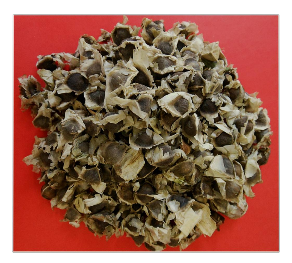
Figure 2: Moringa seed

For the development of potential investment opportunities the three main uses of moringa can be summarized as: