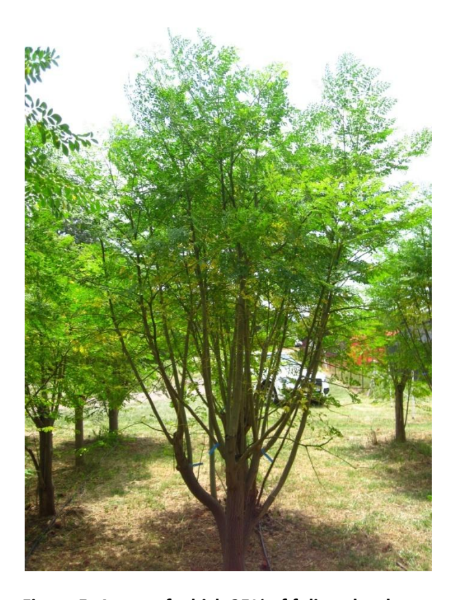
Figure 5. A tree of which 25% of foliage has been removed.