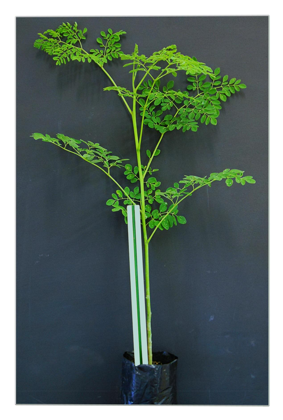
Figure 10. A typical Moringa seedling