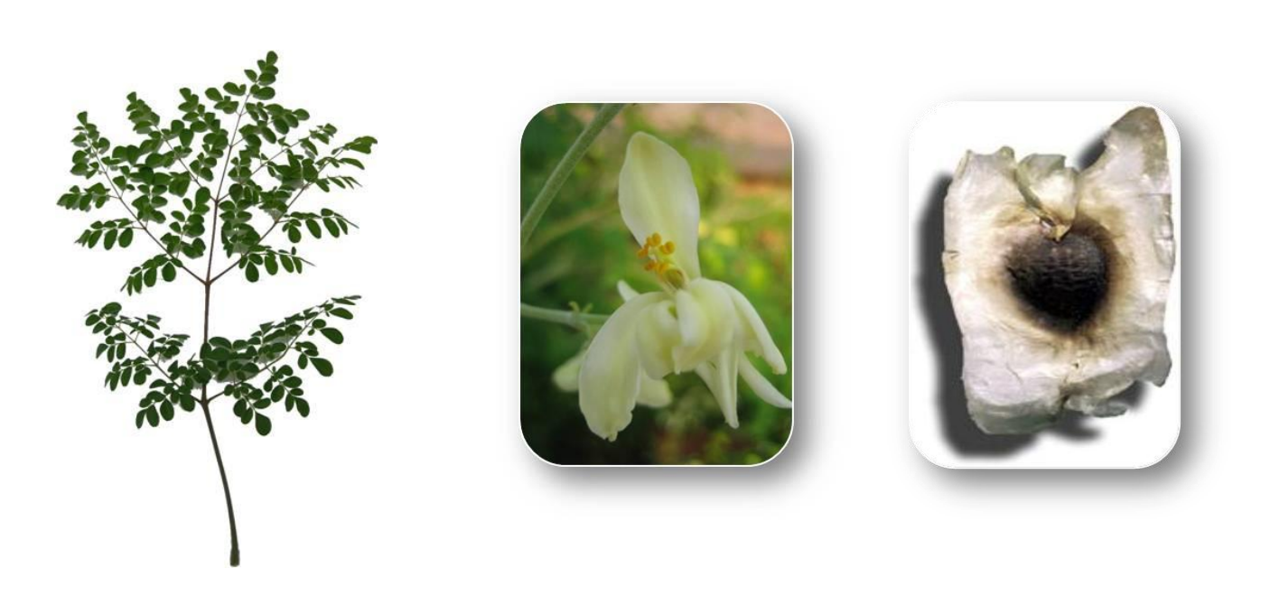
Figure 1: Moringa oleifera leaf, flower and seed (Fuglie, 2001)

M. oleifera is a medium-sized tree that reaches about 10m in height. It has a straight trunk about 10-30cm thick with bark that is whitish grey, corky, with longitudinal cracks. It also has a tuberous taproot to tolerate drought conditions. The umbrella shaped tree comes with a loose crown of feathery foliage. The foliage is evergreen or deciduous depending on the environment. In season the tree is covered with creamy white, honey-scented flowers arranged in drooping panicles. Flowers are insect pollinated and require a large number of insect visitations, with bees the most common.