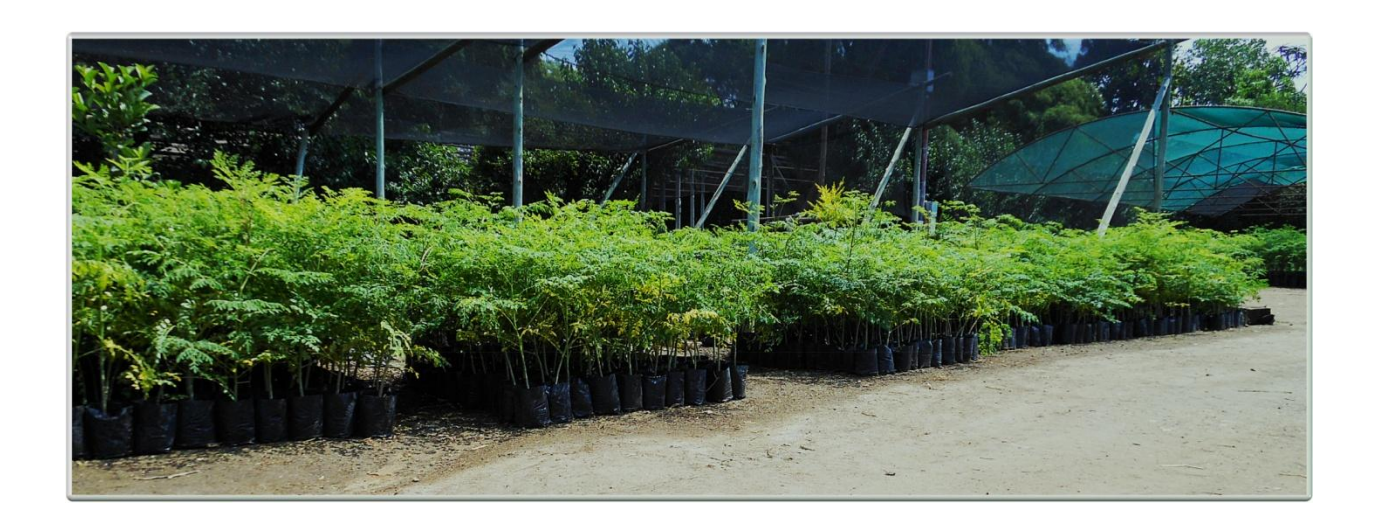
Figure 8: Moringa trees grown in plastic bags