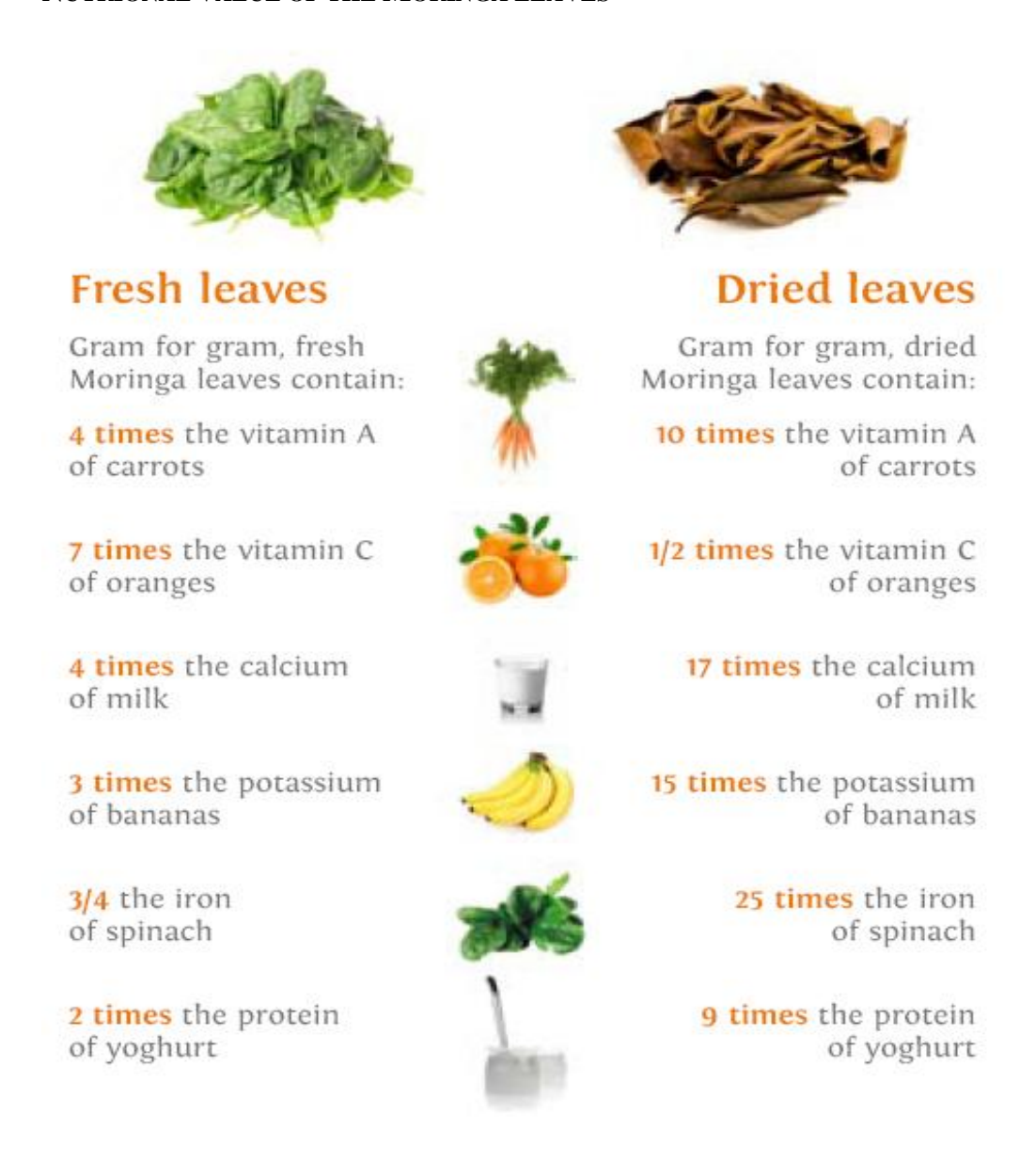
Figure 4. Nutritional Value of Moringa leaves (adapted from Palada and Chang, 2003)

In Africa a multi-purpose crop, such as the Moringa tree, will benefit the food, biofuel and several other industries. Several reports from Southern Africa strongly support that this "miracle tree" would benefit the rural communities of Africa in which large scale plantations will provide substantive real employment opportunities and provide a sustainable income for marginalised communities. Moringa produce can be consumed or sold as a food source, cooking oil, fodder, biofuel, as well as contribute to the improved quality of water supply in rural areas. This tree is a suitable candidate for commercial establishment in different areas in Africa, as it, despite