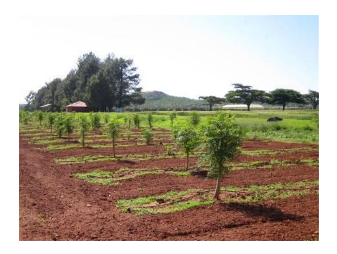
Figure 3: Regrowth on pruned Moringa oleifera trees