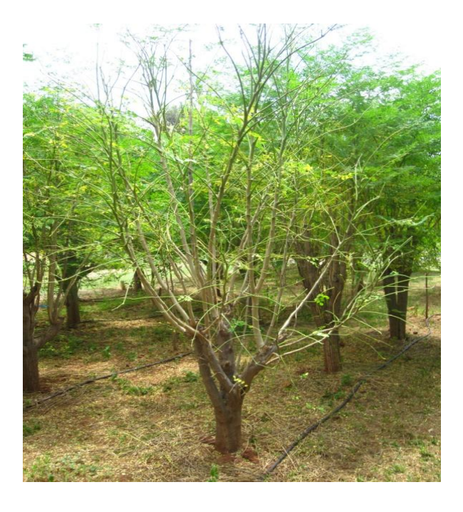
Figure 6. A tree of which 100% of foliage has been removed. The tree will survive this treatment as the buds in the axils of the current season branches are still intact.