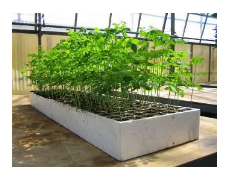
Figure 7: Moringa oleifera seedlings in seedling trays.