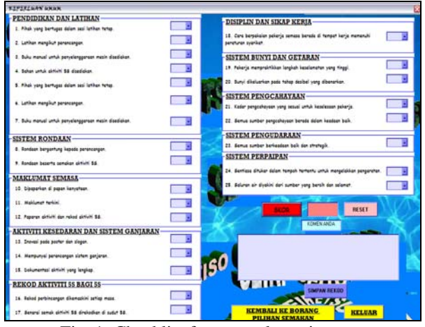
Fig. 1: Checklist for general requirement

ii) Company B - Company B was established on 17 March 1975 as a joint venture project between Malaysian and Japanese partnership and granted pioneer status for the manufacture of flexible light packaging materials. Several years ago, the ownership of this company has been changed due to the business culture. Since its inception, this company has led the local converting industry by being listed on Kuala Lumpur Stock Exchange in 1990 and obtained SIRIM's certification of its ISO 9001 Quality Management System in 1996 and ISO 140001 Environmental Management System in 2000. Its vision is to become a No. 1 ASEAN Company for Quality, Cost and Delivery in parallel with its mission which is to be a total package solution provider. Besides manufacturing conventional packaging products, Company B produces special application packaging for medical, pharmaceutical, seasonings and electronic industries. As part of the company's commitment to environmental protection and corporate social responsibility, it changed its waste water treatment system in 2002 to one using "Cleaner technology".