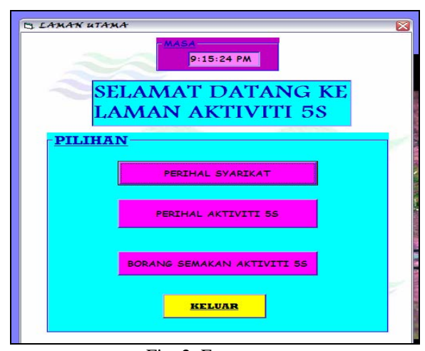
Fig. 2: Front page

C. Development of a Practical System through Visual Basic Software