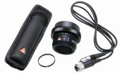
SLR Photo Adaptor