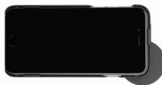
Optional mounting Case for iPhones