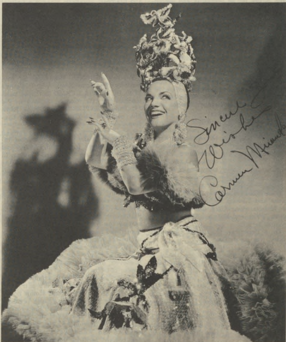
If the South American Bombshell, CARMEN MIRANDA, has a hidden weapon . . . it must be in her hat.