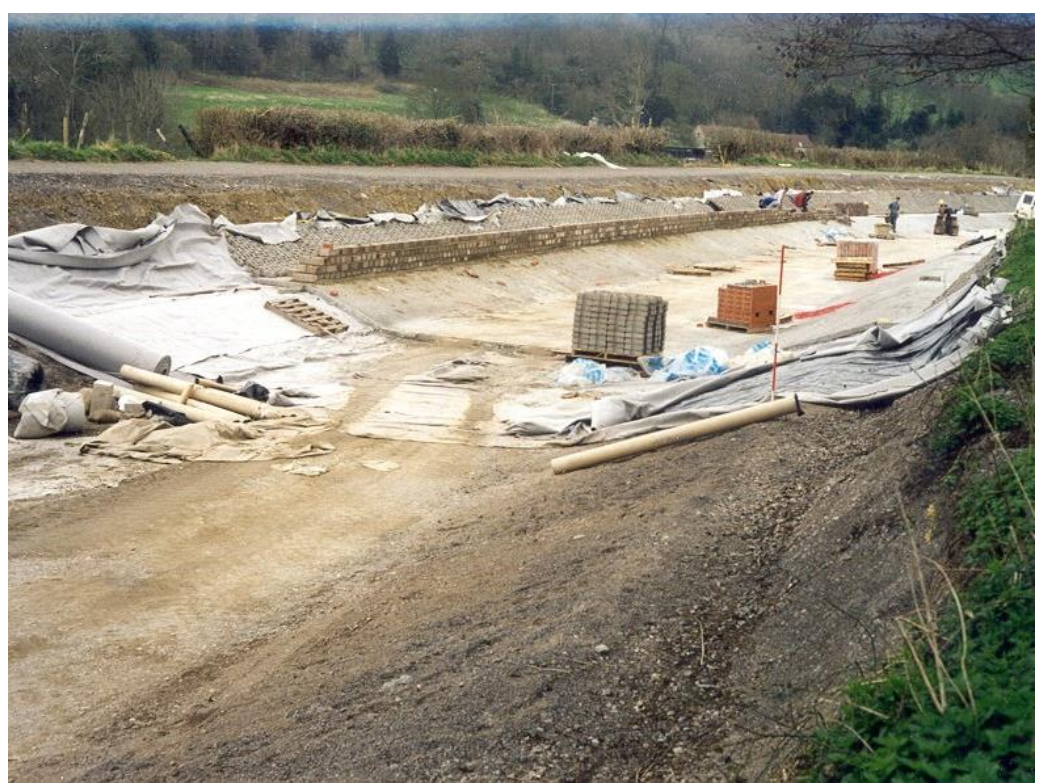
Above - Kennet & Avon Canal