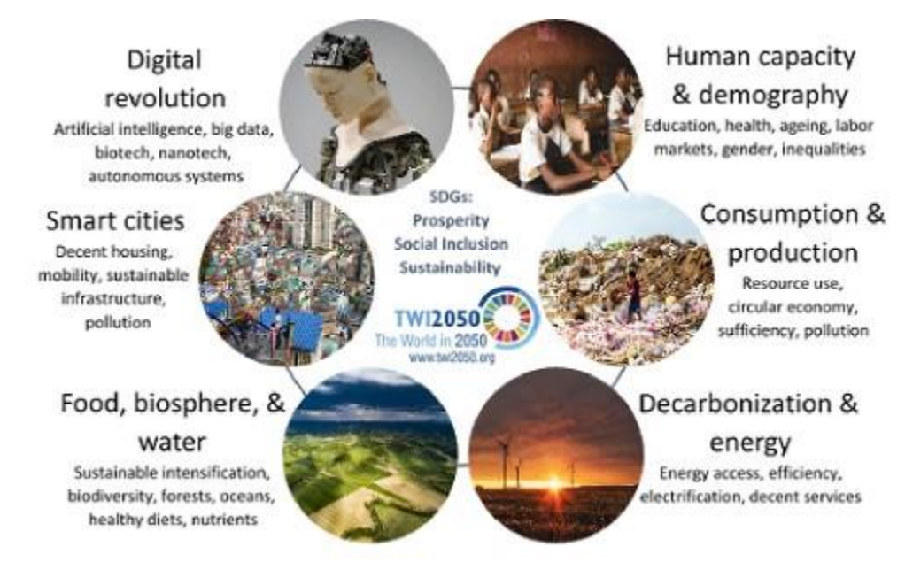
Transformations for Sustainable Development, as identified by TWI2050.