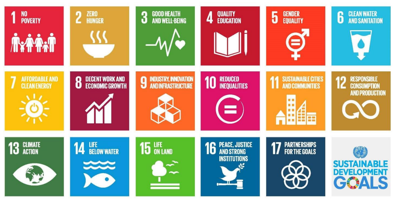
The Sustainable Development Goals, in brief. Detail on targets, indicators, and direct investments associated with each goal can be found at <u>https://sdgs.un.org/goals</u>.

Goal 1: End Poverty in All its Forms Everywhere