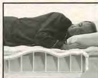
Select Comfort contours to your body.

Also it keeps your spine in its natural alignment . And that lowers the tension in the surrounding muscles. So you can sleep comfortably in any position and wake feeling great.