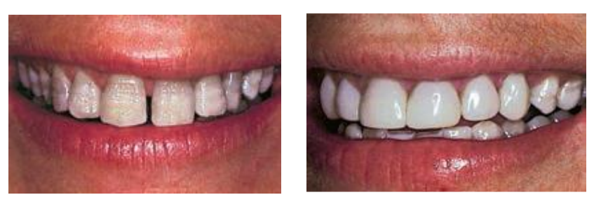
Fig 6: Enamel hypoplasia of maxillary anterior teeth, Direct full veneers using lightcured composite (20).

Extensive enamel hypoplasia involving all maxillary anterior teeth was treated by placing direct full veneers. Placing direct full composite veneers is very time consuming. (19)