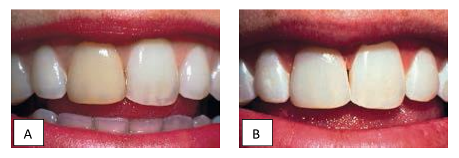
Fig 1: A, The maxillary right centralincisor exhibits bright intrinsic yellow staining as a result of calcific metamorphosis. B direct-composite veneer reduce brightness and intensity of stain and simulate vertical areas of translucency.(6)

1. Advanced esthetic problems of anterior teeth. Tooth discolorations, rotated teeth, coronal fractures, diastemas, discoloured restorations, palatally positioned teeth, abrasions and erosions are the main indications for direct laminate veneer restorations. (5)