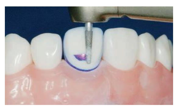
Fig (10): Gingival one third reduction