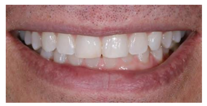
Figure 11: Displeasing composite veneer on tooth