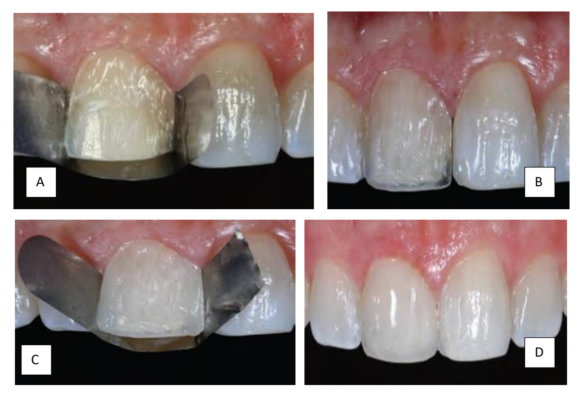
Figure 18: A.Application of DA2 composite.B. Composite characterization C.High-value translucent placed and light-cured D.Enamel blend matching natural tooth.

portion of #8, create characterizations similar to those observed in #9, and lightcured.