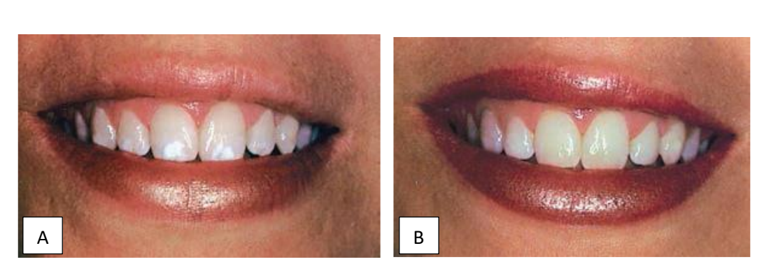
Fig 5:A Hypocalcified areas of maxillary anterior teeth. B restoring with directcomposite partial veneers. (18)