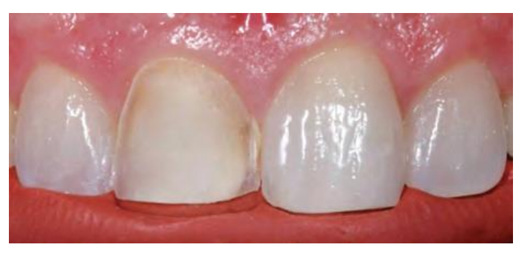
Fig (15):Tooth preparation

• The preparation left sufficient room for creating incisal characteristics and opalescence.