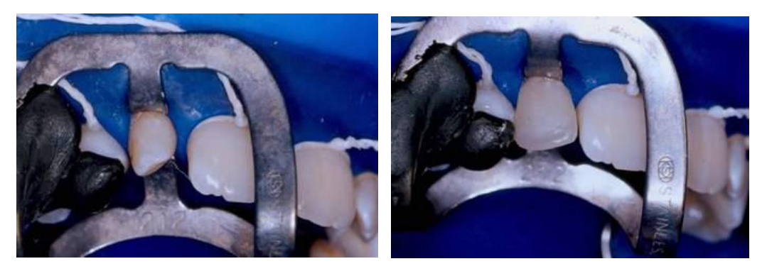
Fig 2: Peg lateral incisor(8)

Para function, faulty occlusion, or loss of vertical dimension. It is essential to pay careful attention to how function and the desired esthetics relate, evaluate the condition on a mounted model using a face bow.(7)