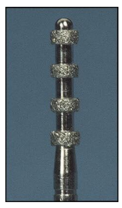
Fig (14): depth cutting burs

• The patient was anesthetized and no retraction cord was placed. The existing composite restoration on #8 was carefully removed. Then the use of depth cutters has been recommended to control tooth preparation as standardized objects allow accurate judgement of depth(44).