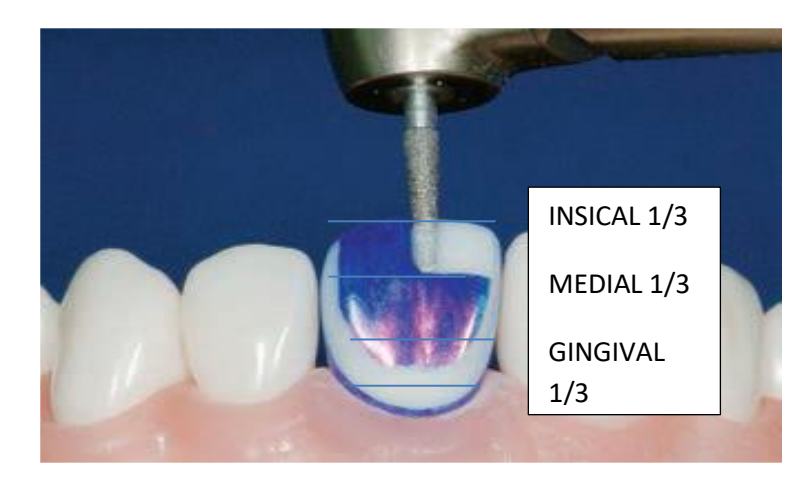
Fig 7:facial reduction(36)

A tapered, rounded end diamond instrument is used . It is critical that the tip diameter of the diamond be measured because the diamond will serve as the measuring tool in gauging proper reduction depth. A diamond with a tip diameter of 1.0 to 1.2 mm is recommended. The tip diameter of the diamond used in this series is 1.2 mm.(35)