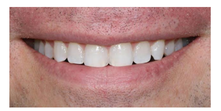
Fig 20: Finished Case