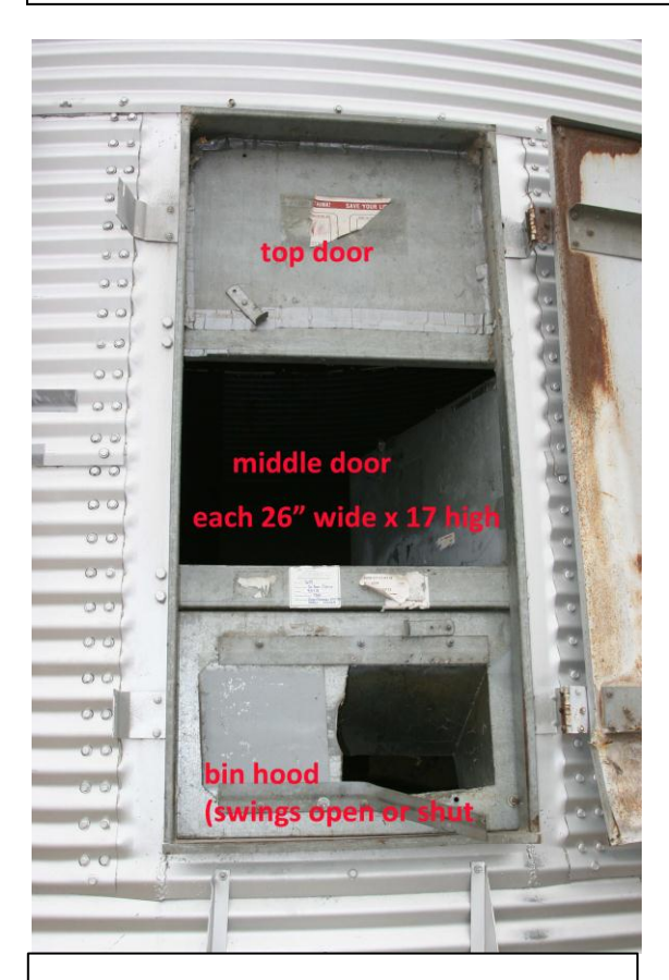
Exhibit 2. Side access door