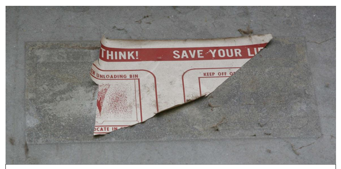
Exhibit 6. Warning sign that was on the top section of the bin's side access door

The Iowa FACE project thanks this victim's family and employee for assistance in developing this case report.