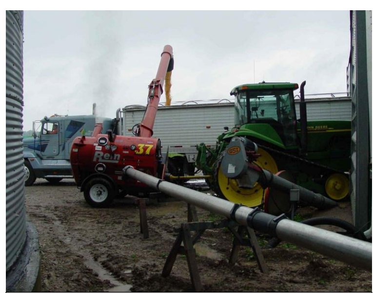
Exhibit 3. Stock photo of REM 3700 grain vac loading grain into truck