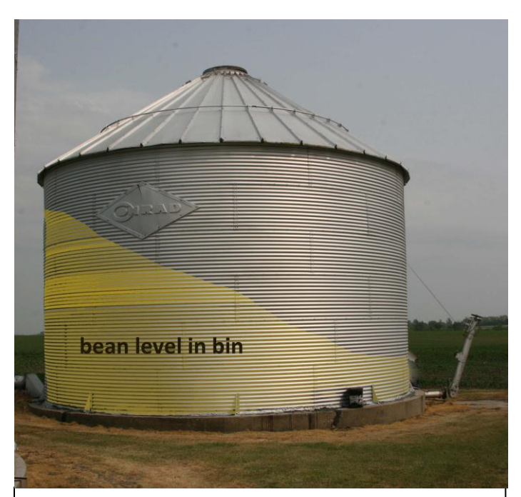
Exhibit 5: Schematic depiction of the level of beans in bin following rescue

Exhibit 5 shows a schematic depiction of the contents of the bin as viewed from the side, based on the depth of beans measured by counting bin rings.