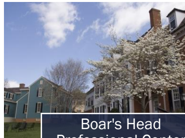
Boar's Head Professional Center