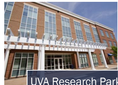
UVA Research Park

Established in 1986, UVAF is a full-service real estate development and management company, working in close collaboration with UVA leadership and the Office of the Architect. UVAF actively identifies, acquires and assembles land holdings, enabling UVA's future expansion and enhancing its boundaries. Often, UVAF engages in the planning and development of these land holdings on behalf of and in partnership with UVA. UVAF provides professional property management services for its own holdings and for fraternity and sorority houses, is experienced in historic renovation projects and actively supports UVA's capital campaign by managing its real estate gifts and charitable gift annuity programs. In addition to its role with real estate, UVAF provides a full menu of financial and administrative services to many of UVA's related foundations, including administration of a 17-member health benefits consortium.