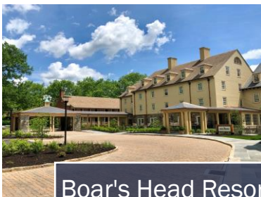
Boar's Head Resort

The University of Virginia Foundation (UVAF) has supported the University of Virginia's (UVA) academic, research, and public service mission by providing strategic real estate, financial and administrative services for nearly 30 years.