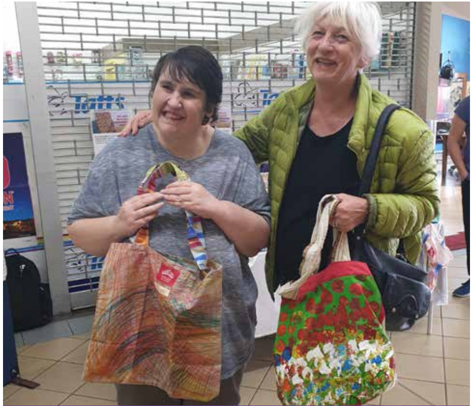
BOOMERANG BAGS | SEE PAGE 27 FOR STORY