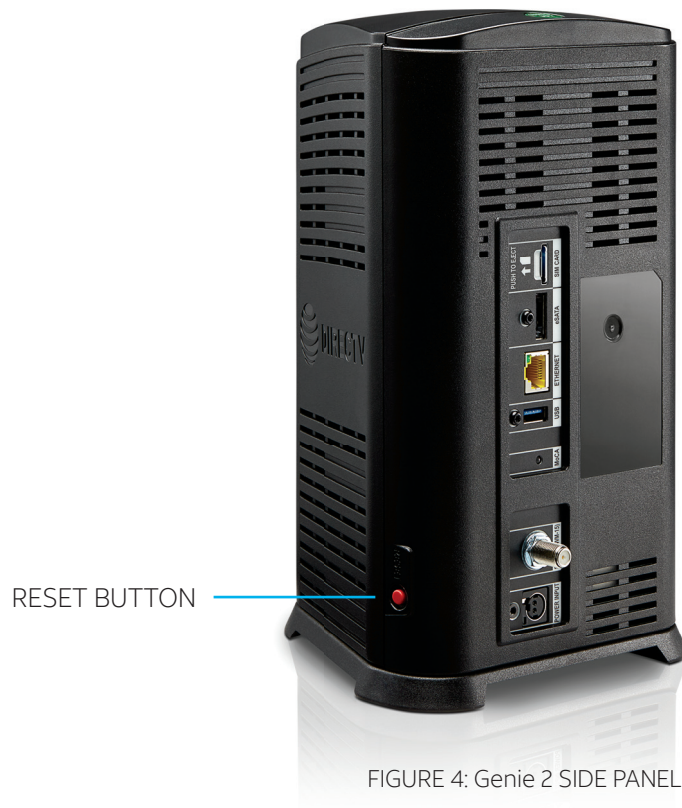
FIGURE 4: Genie 2 SIDE PANEL

To be used only when instructed by AT&T agent during troubleshooting