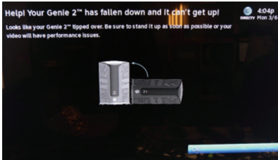
FIGURE 6: TILT ERROR ON-SCREEN DISPLAY

Text: “Help! Your Genie 2 has fallen down ...”