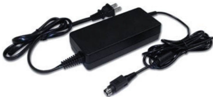
FIGURE 5: EPS17 POWER SUPPLY