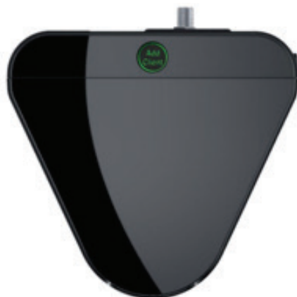
FIGURE 2: Genie 2 TOP PANEL