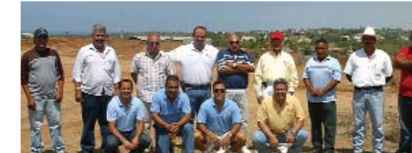
Real de Santa Ana Family and Management Team