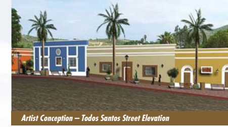
Artist Conception - Todos Santos Street Elevation