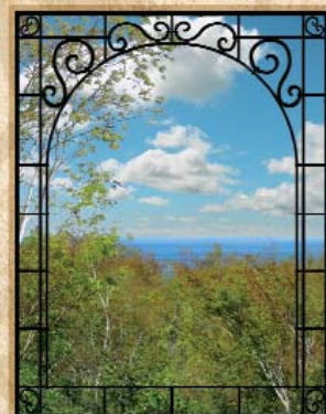
Dwell in the sol of Baja, a Paradise near Los Cabos...