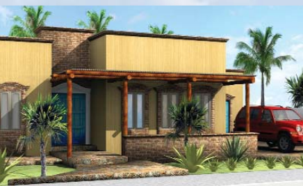
Casa Oasis - Real de Santa Ana

"Our ancestors were farmers who worked the land and raised farm animals here and although we are using the land in a completely different manner, we hope that this use brings honor to them."