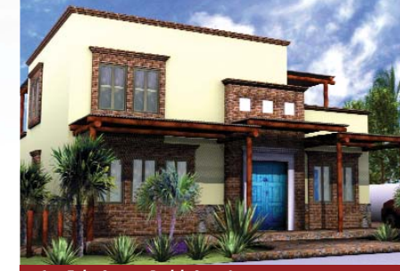
Casa Todos Santos - Real de Santa Ana