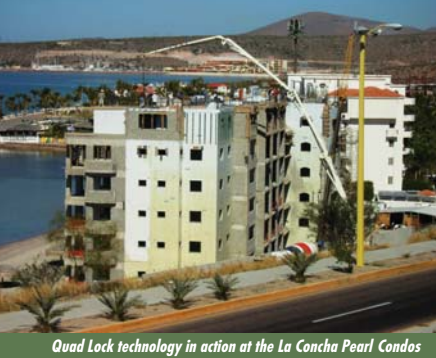
Quad Lock technology in action at the La Concha Pearl Condos

www.newtek.com.mx www.quadlock.com www.laconchapearl.com