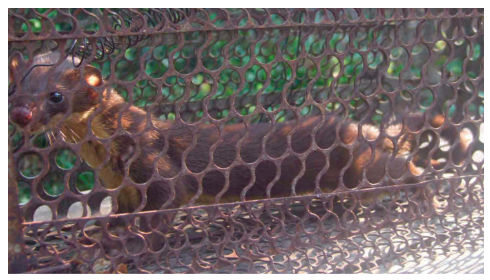
Figure 4. Yellow-bellied Weasel Mustela kathiah , Taksin Maharaj National Park, 13 January 2010.