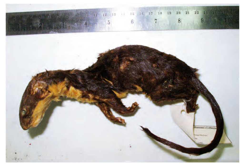
Figure 3. Yellow-bellied Weasel Mustela kathiah , Doi Inthanon National Park, 20 May 2009 (specimen THNHM-M-475).