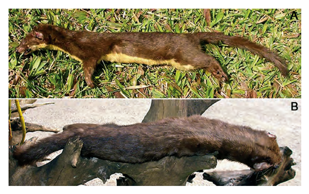
Figure 2. Yellow-bellied Weasel Mustela kathiah , Doi Inthanon National Park, 23 November 2008. Side (A) and dorsal (B) views.