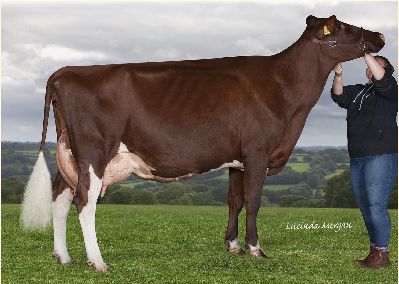
Attwoods Tabia – EX92 Daughter of Rodway Tabia 5 th (Lot 6) Full Sister to Attwoods Tabia 2 nd (Lot 21) Supreme Champion North Somerset Show 2017 Supreme Champion New Forest Show 2017