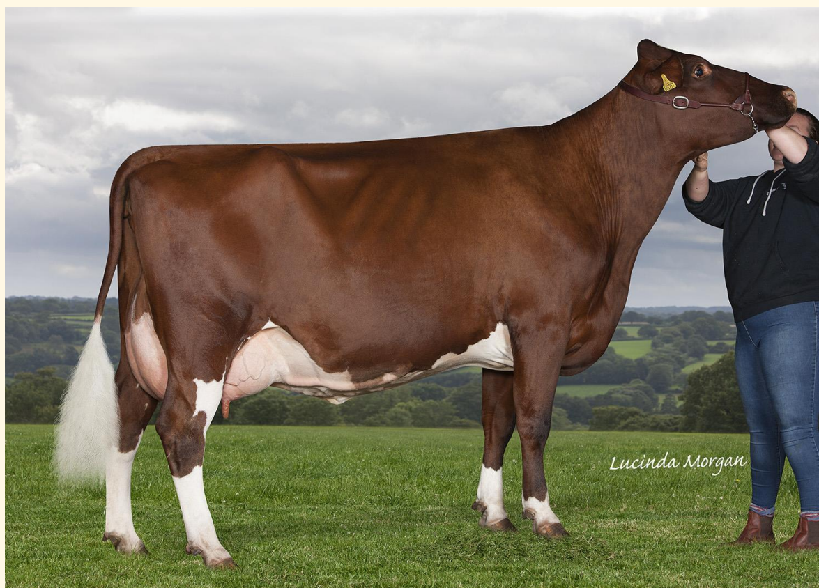
Attwoods Tabia 2 nd – VG86

Full sister to Attwoods Tabia EX92 (3 rd lac) – Twice Supreme Champion