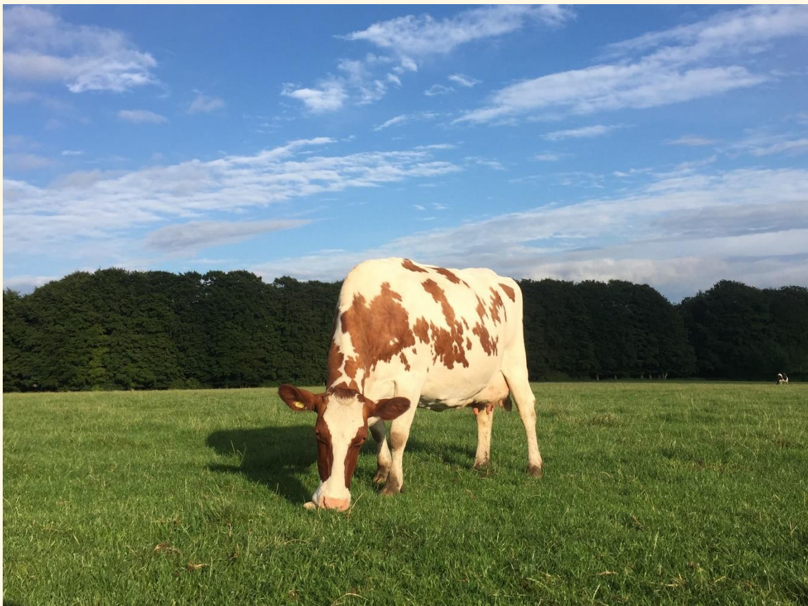
Attwoods Pretty Polly 2 nd - EX90

Served 14/04/2017 to Kilsally Redford, due 19/01/2018 PD+