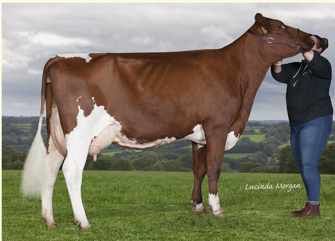
Attwoods Grey Rose 2 nd – VG85

Reserve Champion Any Other Breed Dairy – New Forest Show 2017