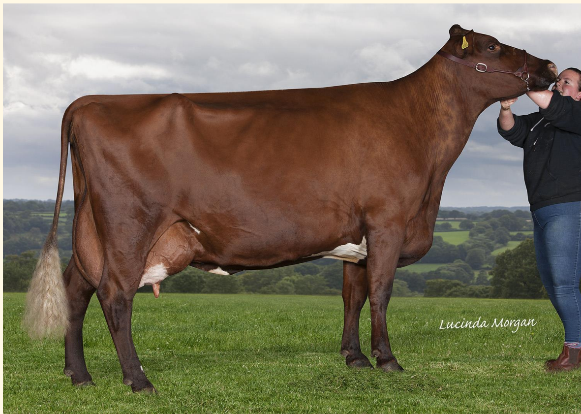
Rodway Tabia 5 th - EX91 Dam of Lot 21