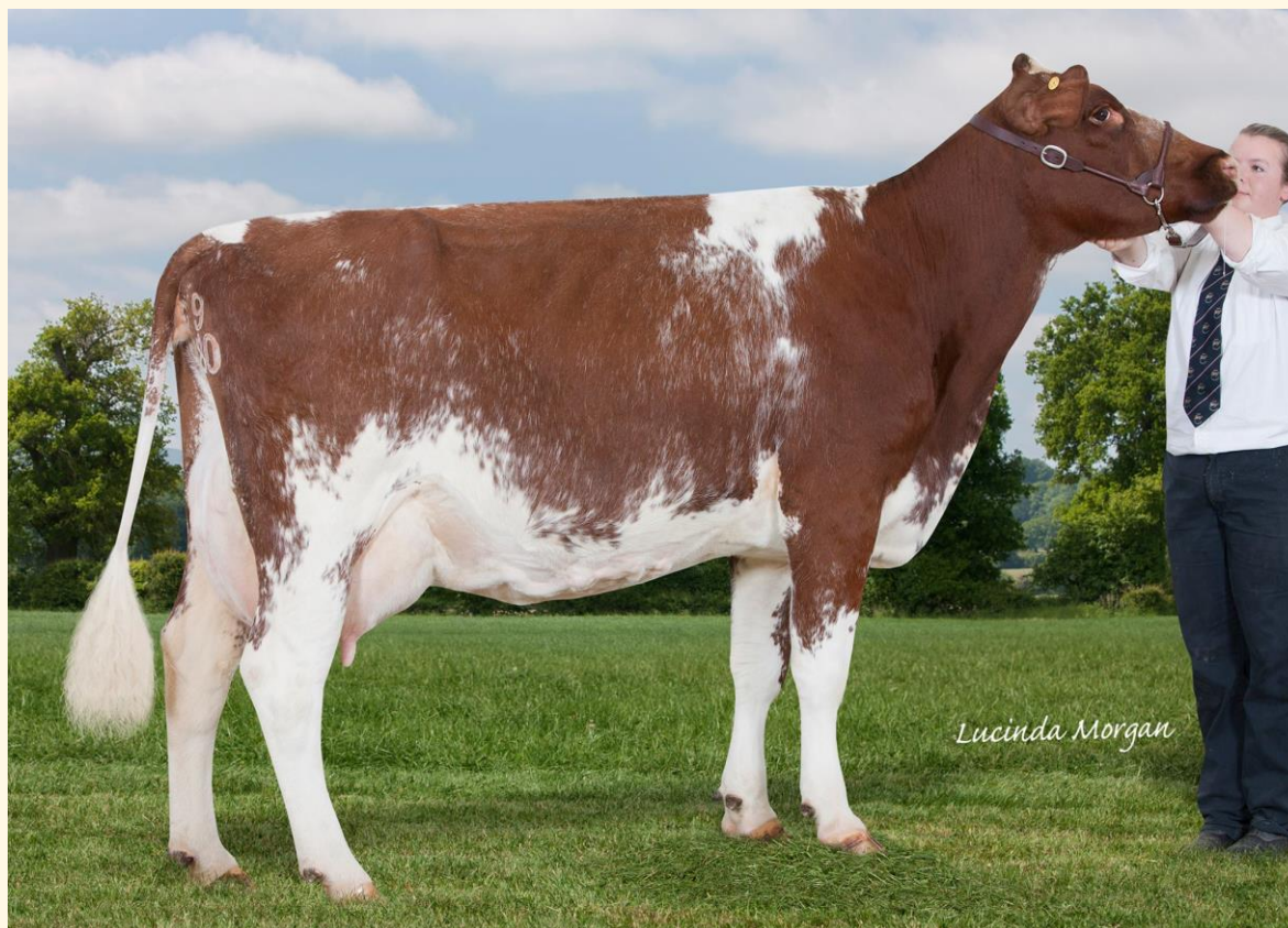
Rodway Grey Rose 26 th - GP83 Dam of Lots 15 & 22