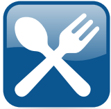
Food Service & Preparation

These helpful icons will show you the best glove products for your needs.