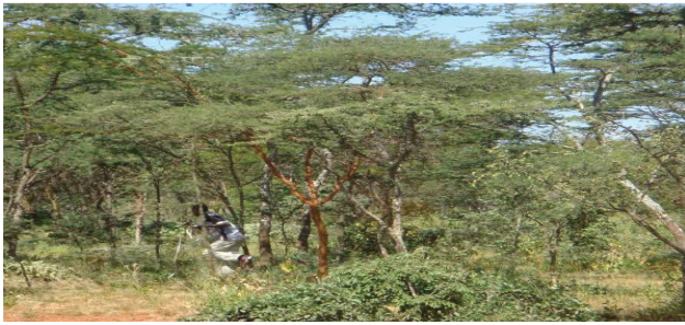
Figure 7: Dense population of A. drepanolobium trees mixed with A. seyal and few other species in the Borana rangelands, southern Ethiopia, Adopted from Terefe et al. 2009 [50].