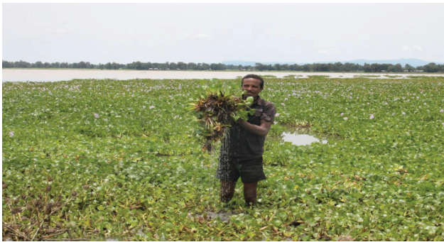
Figure 6: Distribution of water hyacinth in Lake Tana, Source: Adopted from Wassie Anteneh (2014) [54].

irrigation, electric generation, fishing, drinking, and meeting other needs, and is therefore an added constraint on development [38]. Water hyacinth was the most abundant aquatic weed on the water bodies and perceived as one of the most important noxious weeds [39]. As reported by different scholars, impact of water hyacinth gets higher whenever there were mats. The most noticeable impacts that were reported by most researchers include: restricting proper water flow, water loss through excessive evapotranspiration, interference with fishing, grazing and crop production activities (accessibility to land water hindered), effect on power generation, increase siltation, flooding, increase cost of production and effect on native plants [39]. Though vital epidemiological data pertaining to incidence of human diseases were not obtained during this review, there is a general increase in disease incidences as a result of provision of vector breeding grounds. Some of the human diseases reported include skin rash, malaria, and bilharzias. These results showed that the impact of water hyacinth might be categorized into social, economical and environmental impacts. Fishers, riparian communities, Institute of Biodiversity, National Agricultural Research Institute, sugar corporation/sugar factories, Ministry