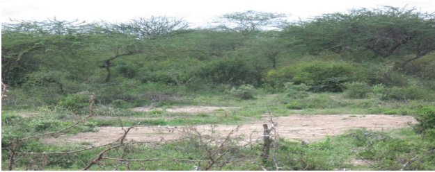
Figure 8: Encroached condition in Borana rangeland Adopted from Adisu Abebe (2009) [43].

include encroaching bush lands, quickly takes over valuable grazing lands and its dense growth suppressed grasses and other useful forages under its canopy.