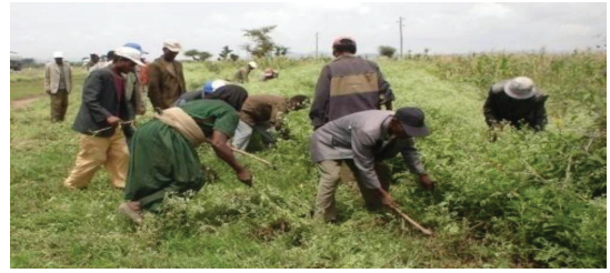
Figure 2: Villagers clearing a dense stand of parthenium weed adopted from International Parthenium News Number 2, July 2010.

According to Shashie Ayele [20], hand weeding of parthenium is not advisable as the weed causes contact dermatitis, asthma and fever to human beings. In addition, hand weeding is laborious as it requires frequent work following the emergence pattern of the weed. Hoeing can also be used to get rid of parthenium, but repeated operation is needed as long as there is the seed of the weed in the soil. Manually removing parthenium is the most ideal method. However, it is effective as a method only in limited areas such as residential colonies and agricultural fields. The weed should be uprooted to prevent its regeneration from the remaining lateral shoots and that the uprooting should be done before its flowering period and when the soil is moist enough to facilitate easy removal. In Ethiopia, Presently, hand weeding of Parthenium is primarily conducted by men & women as well as school-age children as shown in figure 2.