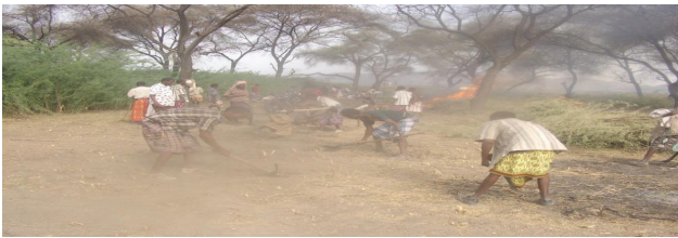
Figure 5: Clearing of P. juliflora by the pastoralist communities for crop cultivation adopted from Dubale Admasu 2006.