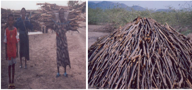
Figure 4: Fire wood of P. juliflora as income generation adopted from Shetie Gateway (2008) [34].