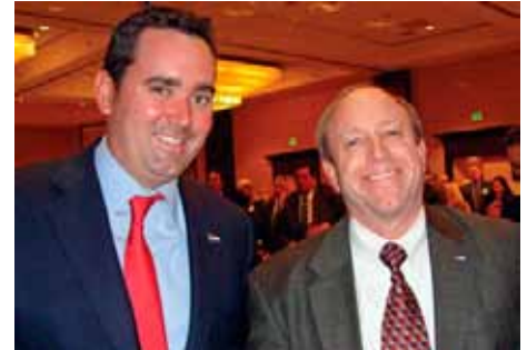
State Treasurer Walker Stapleton and Attorney General John Suthers were in the audience.