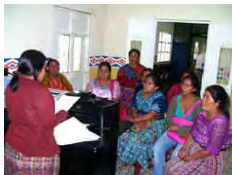
Pictured are members of one of the trust banks being trained in business practices by a Friendship Bridge loan officer.

Kakchiquel population of 45,000, half of whom are women. By providing impoverished, indigenous