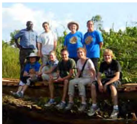
The bridge building team sitting on their bridge.

In July 2011, 6 teens from District 5450 traveled from Colorado to rural Kenya. Their purpose: to serve in another culture. Comprised of kids from interact clubs at Evergreen and Conifer High schools, the District 5450 contingent was joined by a young woman from Castle Rock and another student from Commerce City. The group spent three days going to school with Kenyan Secondary School students and then built a much needed footbridge. The bridge was close to the primary school and 40% of the students needed to cross the river on that old and shaky bridge that flooded in the rainy season. Walking around via another route involved a 3-hour trek, one way. Funding for the new bridge materials was provided through the Conifer Rotary Club and a global grant through District 5960.