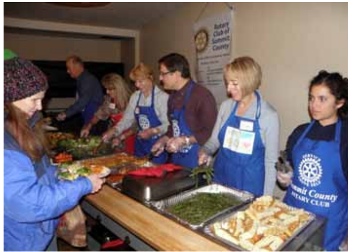
Above: Summit County Rotarians provide Service with a smile!

On December 13, 2011, Summit County Rotarians served 557 dinners on that one night, a new record. And at some point during the first community dinner of 2012, on January 3 rd , the