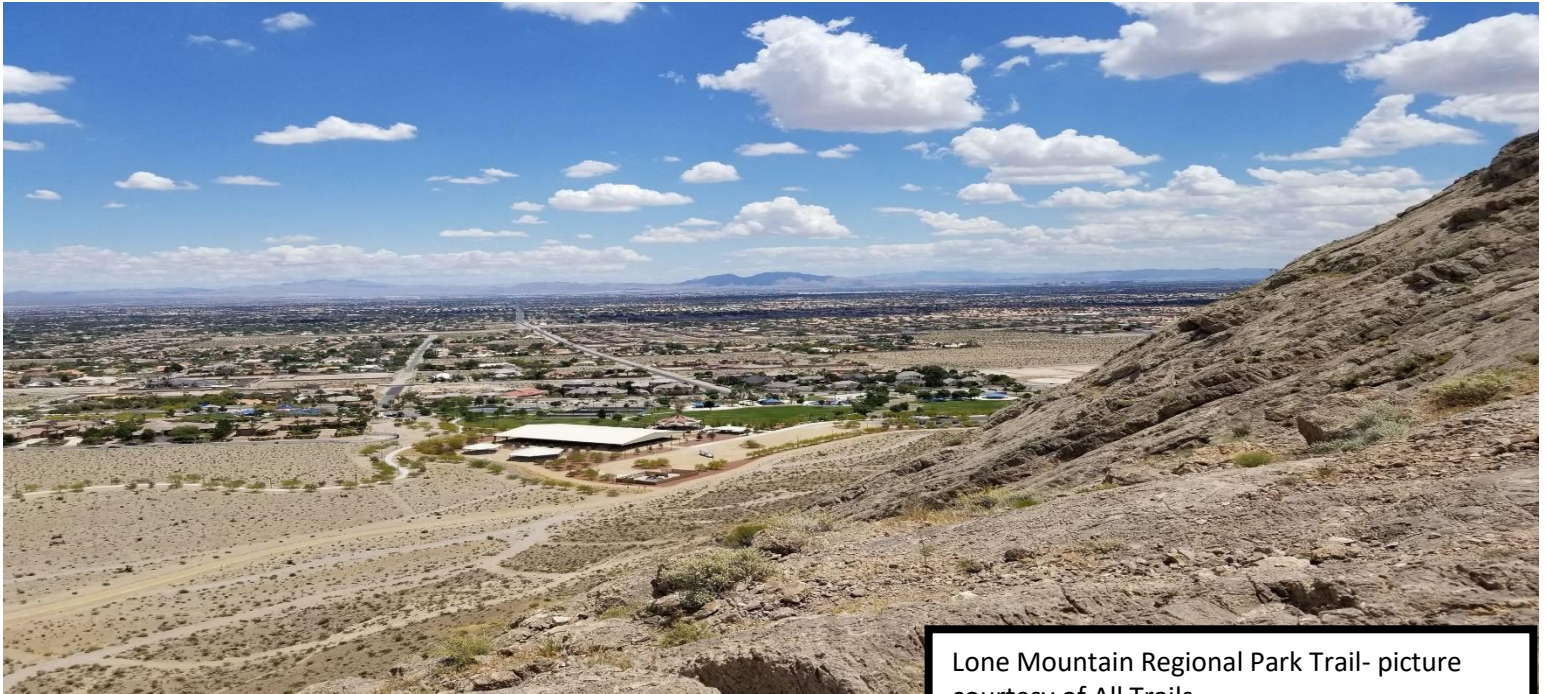
Lone Mountain Regional Park Trail