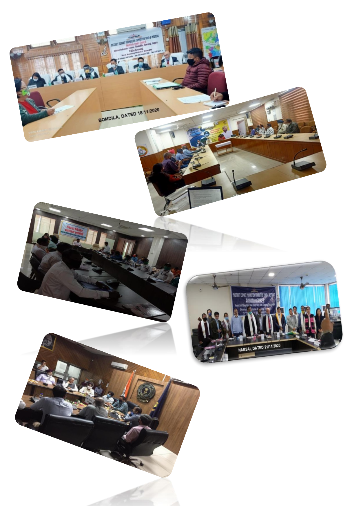
Page 5 of 8