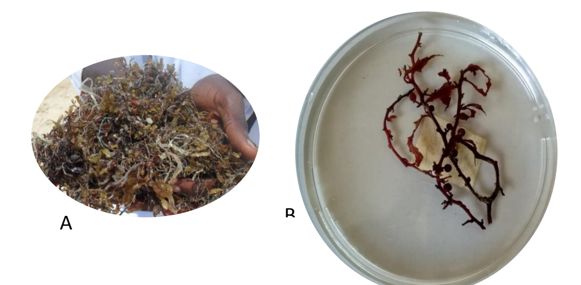
Figure 1.2a Sargassum mass found at Ajegunle Erun-Ama Beach, Ondo State Nigeria A=mixed S. natans and S. fluitans , B=lateral branches with gas bladders.

Macroalgae include members of the green, red and brown algae that grow under the sea and have their roots attached to the sea bed except for particular floating brown algae Sargassum natans and S. fluitans (Fig1.2a, b). Few marine types of macroalgae can exceed 50 m in length.