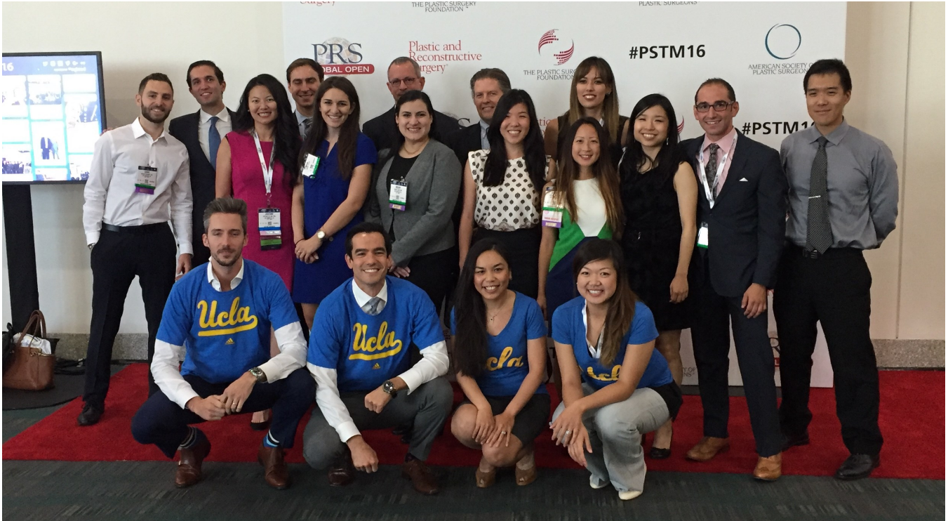
September 2016: UCLA Residents competed at the ASPS Residents Bowl in Los Angeles. UCLA upset the two time champions, Ohio State, in the first round.