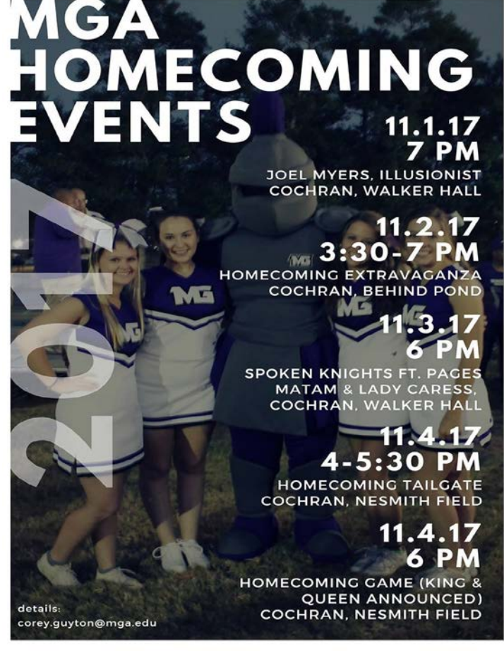
PRESENTED BY THE OFFICE OF STUDENT LIFE