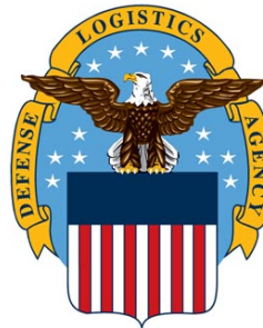
DLA Land and Maritime