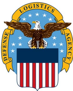
Defense Logistics Agency