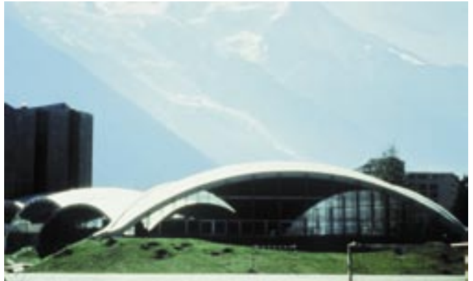
Fig. 7: Heinz Isler, Chamonix Shells below Mont Blanc