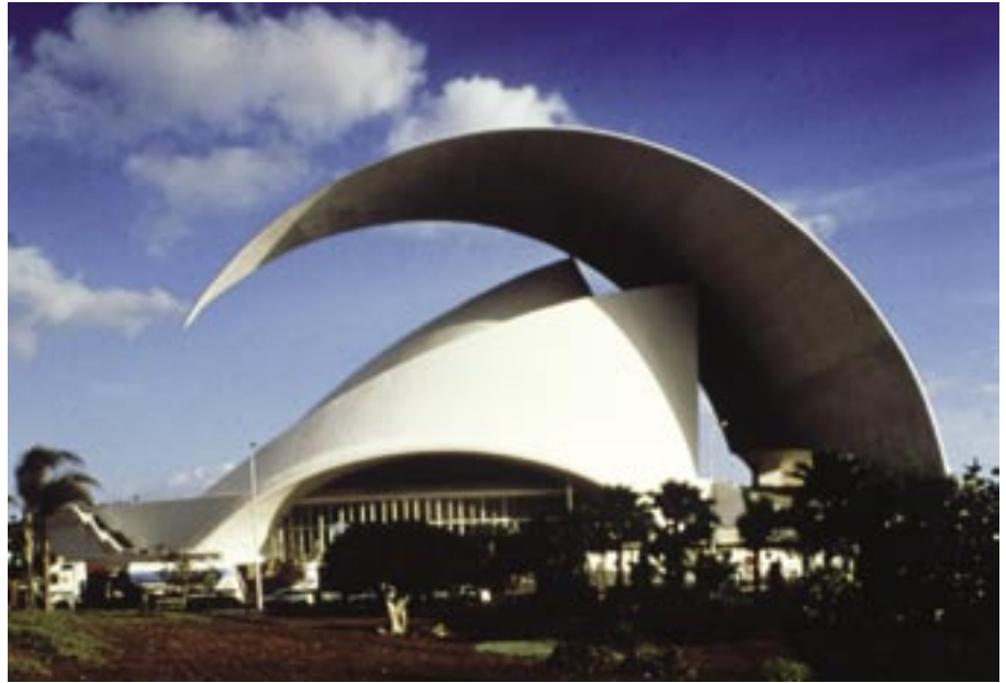
Fig. 9: Santiago Calatrava, Tenerife Auditorium

According to some of those affiliated with the Monolithic Dome Institute, air-formed structures, which apparently are frequently built without the involvement of an architect, seem to have an image