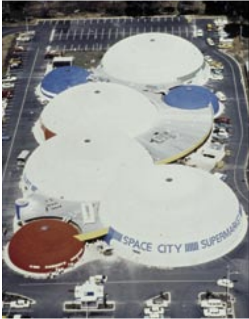
Fig. 5: Kallangur Shopping Center, Queensland, Australia, constructed using the Bini-Shell System

designer Dante Bini's system, in which reinforcing steel and concrete are placed over a layer of fabric while it lies flat on the ground. The fabric is then inflated to create the desired shell form. Numerous so-called Bini-Shells have been built primarily for utilitarian and bulk storage purposes, but also as enclosures of supermarkets (Fig. 5) and recreational facilities such as swimming pools and tennis courts. It has been estimated that more than 1000 domes were built worldwide between 1966 and 1986 using the Bini-Shell system. 2