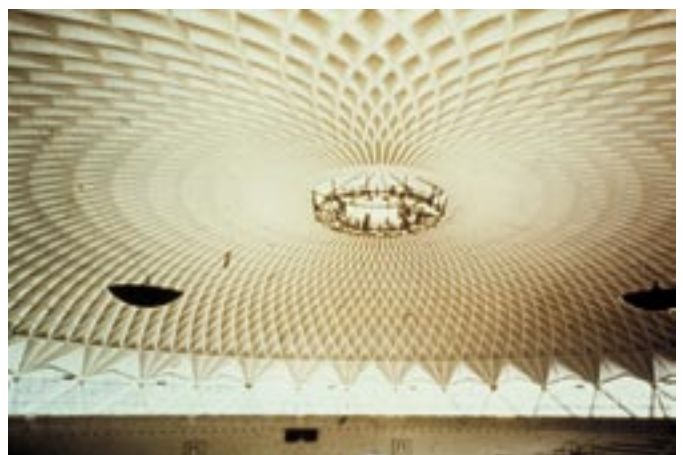
Fig. 1: Pier Luigi Nervi, Palazzetto dello Sport, Rome