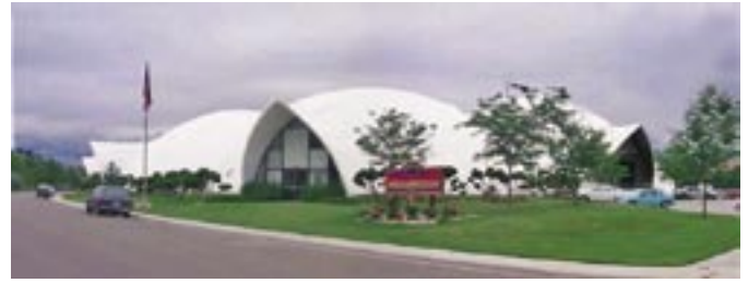
Fig. 6: Monolithic Dome Institute, Public Works Complex, Price, UT

A second alternative forming method currently being used to construct shells in the U.S. is the Modular Forming system by Formworks Building, Inc. Although Modular Forming has yet to be used to construct shells of the size possible with air-form techniques, a company representative pointed out that the system sells well throughout the U.S. He also cited this as evidence that