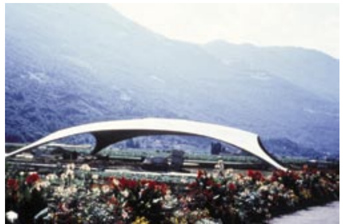
Fig. 8: Heinz Isler, Bürgi Garden Center, Camorino

there is demand for stronger and smaller-scale thin concrete shells that are highly energy efficient. The system consists of modular structural steel forms (tabbed in the appropriate locations to receive reinforcing steel) that are bolted together on site. Because the forms and reinforcement have sufficient strength to support the weight of the shotcrete before it hardens, shoring is unnecessary and the construction cost is significantly reduced.