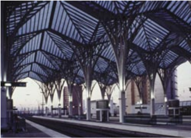
Fig. 10: Santiago Calatrava, Zurich Train Station

indicate that such regional differences in aesthetic preference alone cannot be responsible either. In fact, some of Calatrava's structures can be considered to transcend the traditional concept of concrete shells by breaking them up into networks and filigree work (Fig. 10).