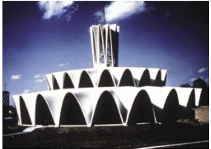
Fig. 4: HOK, Priori, St. Louis