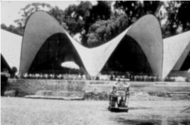
Fig. 2: Felix Candela, Xochimilco Restaurant, Mexico