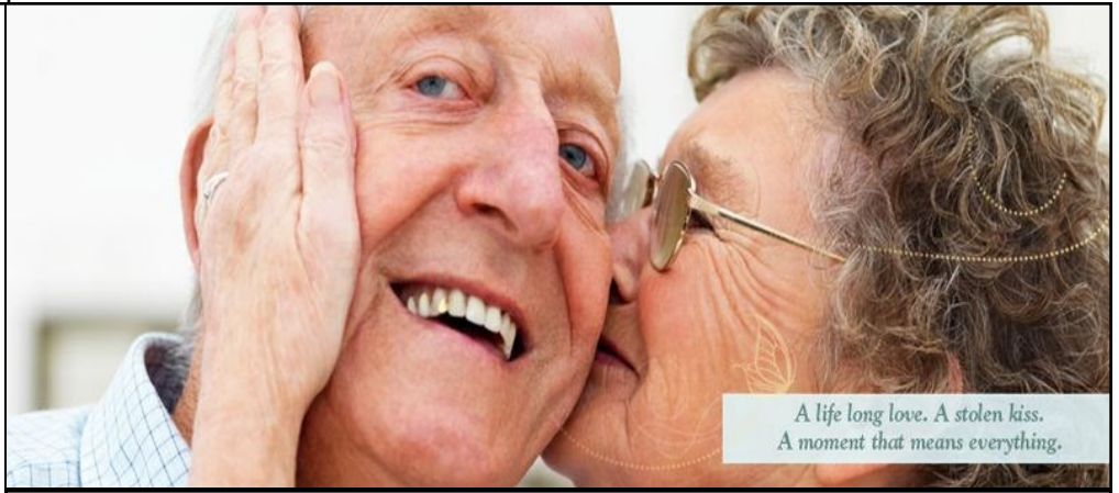
A life long love. A stolen kiss. A moment that means everything.