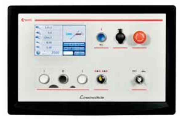
easy touch 7"