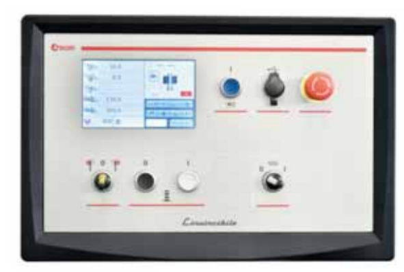
easy touch 7"