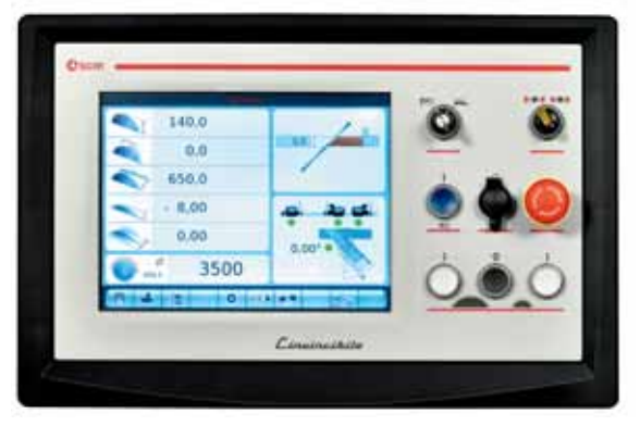
easy touch 12"

The satisfaction of fast and easy-to-use control of all machine functions with the 7" or 12" flat touch-screen colour display. The system guides the operator every step of the way offering suggestions that avoid the operator making any mistakes. Additional calculation functions assist the operator when designing the necessary cuts for assembled components and complex geometrical shapes.