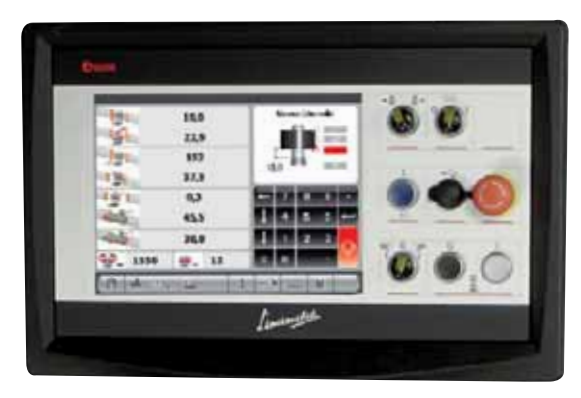
easy touch 12"

For every tool, the machine can be positioned without the necessity of calculation or to create programs due to the possibility of defining the origin point on three different positions of the tool profile. For the most recurring machining jobs it is possible to set the dimensions of the required profile and select the tool to be used. The controls will create the dedicated program to carry out the required machining operations.