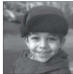
Nace - 34th Ave