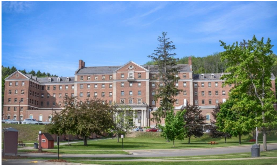
Bath VA Medical Center

The Bath VA Medical Center Psychology Internship Program provides qualified doctoral candidates generalist training with a variety of psychiatric, medical, and geriatric patients in residential and outpatient settings. Internship graduates are prepared for professional practice in VA facilities as well as a wide range of health care settings, including medical centers and non-VA hospitals that primarily serve adults.