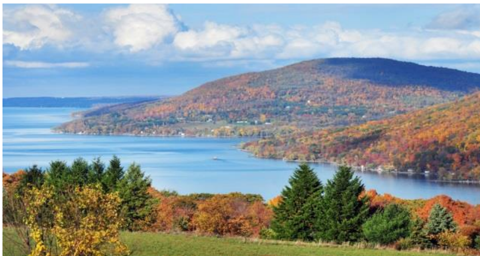
Keuka Lake, located seven miles north of the Bath VA