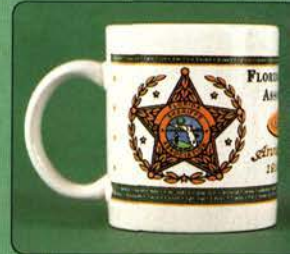
COFFEE MUGS - white color with 85th anniversary type and green bands listing all 67 counties

To celebrate the 85th Anniversary of the Florida Sheriffs Association, we are selling colorful baseball caps, coffee mugs, auto tags, belt buckles, watches and lapel pins. This will give loyal friends and supporters an opportunity to join in the celebration by mailing the order form printed below. Eighty-five years is a mighty long time. The Association has many accomplishments to contemplate with pride, so come on, let's contemplate and celebrate!