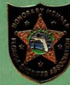
LAPEL PIN 7/8" die cast metal with 4 color enameled finish