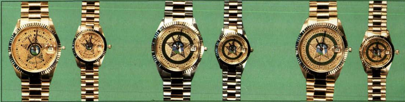
Style # 4200 WOMEN'S GOLD BAND Face No. 3

NOTE: These water resistant, ETA Swiss quartz analog timepieces featuring beautifully engraved "Sheriff's Star" dials in an all gold dress medallion, or a multi-colored sports style are available in both all gold or gold/steel two-tone as depicted above. All watches carry a 3-year limited warranty from the date of purchase against failures due to defective materials or workmanship. Gold or two-tone bands can be purchased with either of the three available faces.