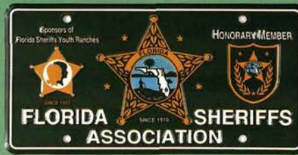
AUTO TAG 6 x 12" - Metal, embossed, 4 colors, baked on enamel finish