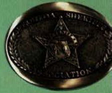
BELT BUCKLE 3 1/2 x 2 5/8" solid brass