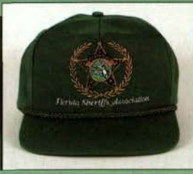
HATS - WHITE OR GREEN with multi-colored embroidery including metallic gold thread