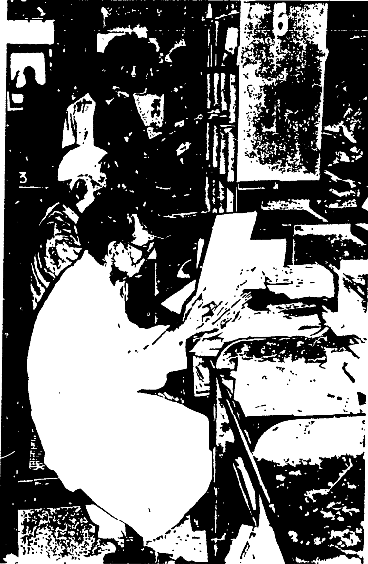
Sorting Mail by Zone