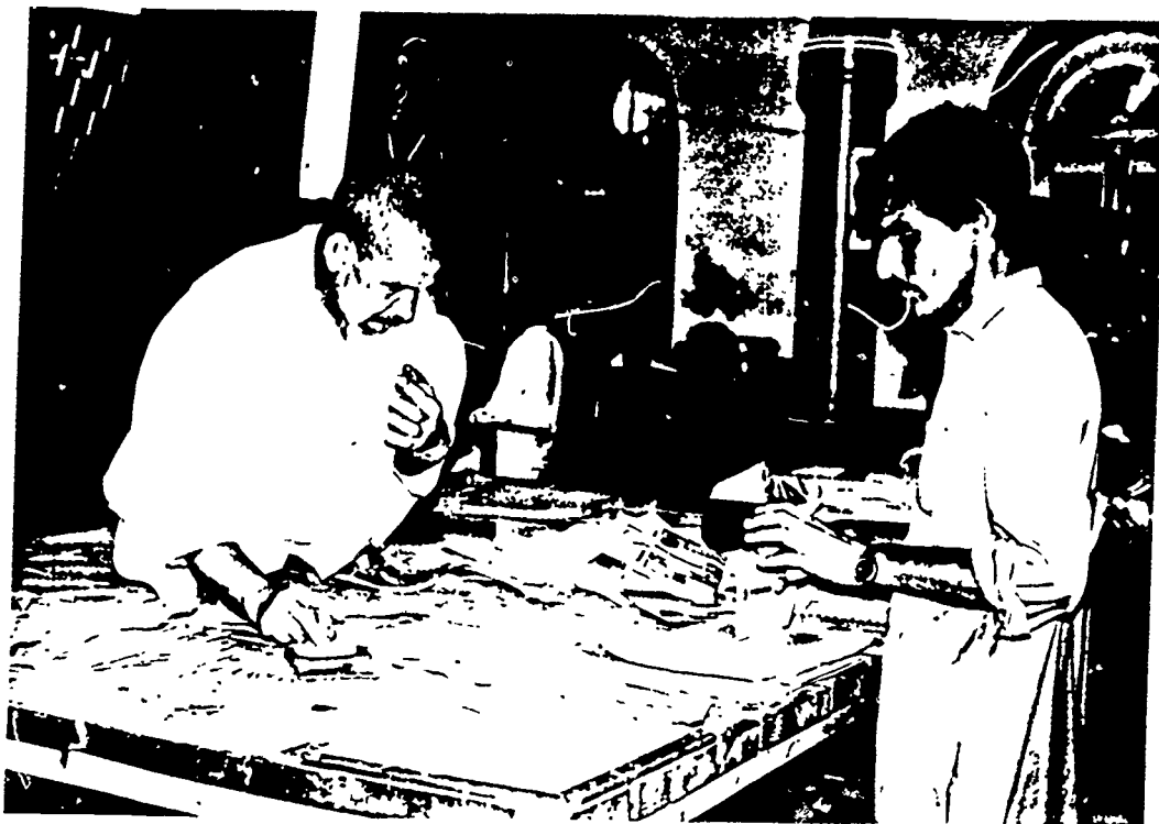
Cancelling Paid Mail