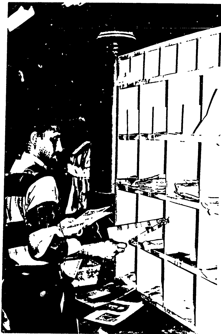
Sorting Mail by Postman