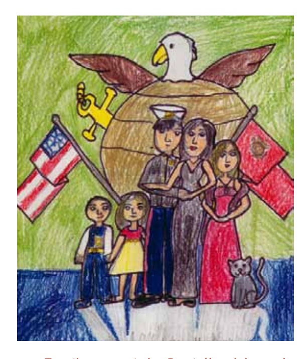
Family portrait by Danielle, 6th grade

From West Point Military Academy located approximately 50 miles north of New York City to the rolling hills of horse country surrounding Fort Knox and Fort Campbell, to the milder climates of the Southeast, DoDEA-Americas schools provide ready-made classrooms for field trips and student enrichment. The areas are steeped in history, from the Revolutionary War through the Civil War and the present, with museums, churches, monuments and plantation homes all brimming with good old Southern hospitality.