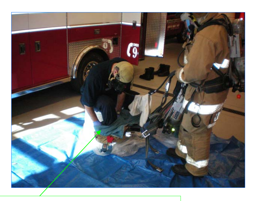
Gloved hands remain on the inside of the gear