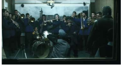
Figures 35–38. Characters boxed in glass cases in Roy Andersson's films (35–36: You, the Living ; 37–38: A Pigeon Sat on a Branch Reflecting on Existence ).