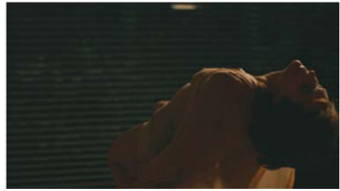
Figures 71–72. Porumboiu’s Police, Adjective : the policeman deeply embedded in his world.