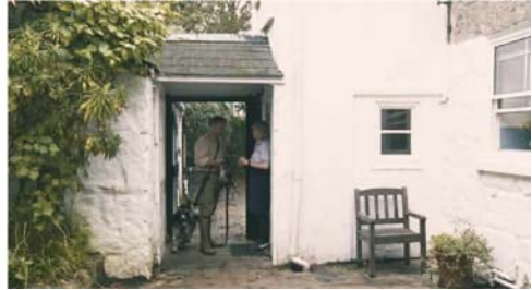
Figures 21–24. 12.08. East of Bucharest: a series of tableaux of domestic interiors: the talk show participants in their natural “habitat.”