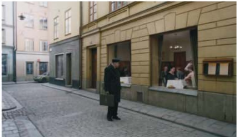
Figures 39–40. A motif taken from Pieter Bruegel the Elder: Hunters in the Snow (1565): birds looking down on humans: a double diorama, boxing in both the birds and the humans as waxwork figures in Andersson's A Pigeon Sat on a Branch Reflecting on Existence .