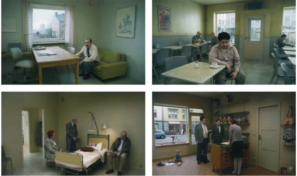
Figures 13–20. Structured interiors, social dynamics reflected in architectural spaces in Joanna Hogg’s films (13–14: Unrelated ; 15–20: Archipelago ).