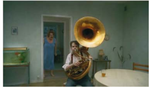
Figures 29–30. Characters appearing as if moving on a stage in Hogg’s Unrelated .