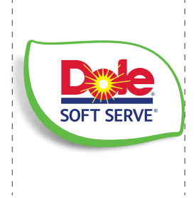
Minimum Space 1.25" min width