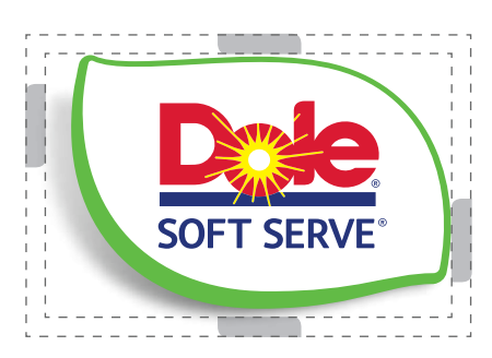
Clear Space Lowercase Dole "L"

To maintain the logo's integrity, keep a minimum amount of clear space around its perimeter. This space is determined by at least the height of the lowercase "L" in any proportion the logo is used. The DOLE SOFT SERVE® logo can't be smaller than 1.25" (31.8mm).