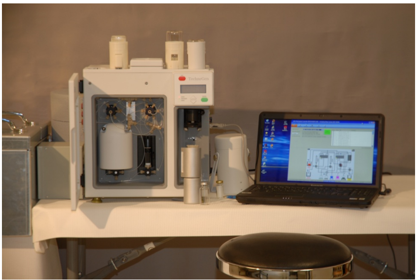
Figure 3: TechneGen Tc99m Generating System

Figure 3 provides a visual of the TechneGen system. The TechneGen system is designed to facilitate ease of installation, training and use. It is virtually a hands-off operation once started and the protocols can be easily followed on the associated computer is desired.