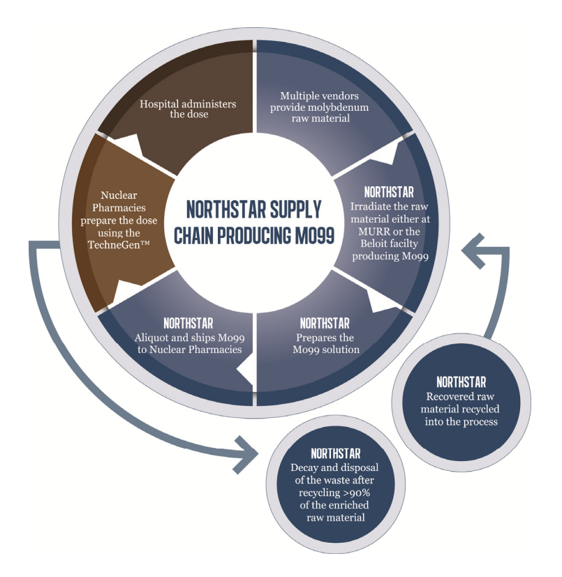
Figure 7: NorthStar Supply chain